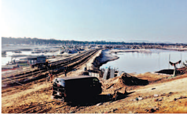
SOMESHWARI RIVER, NETROKONA