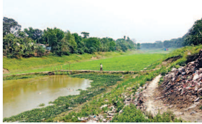
BARAL RIVER, NATORE