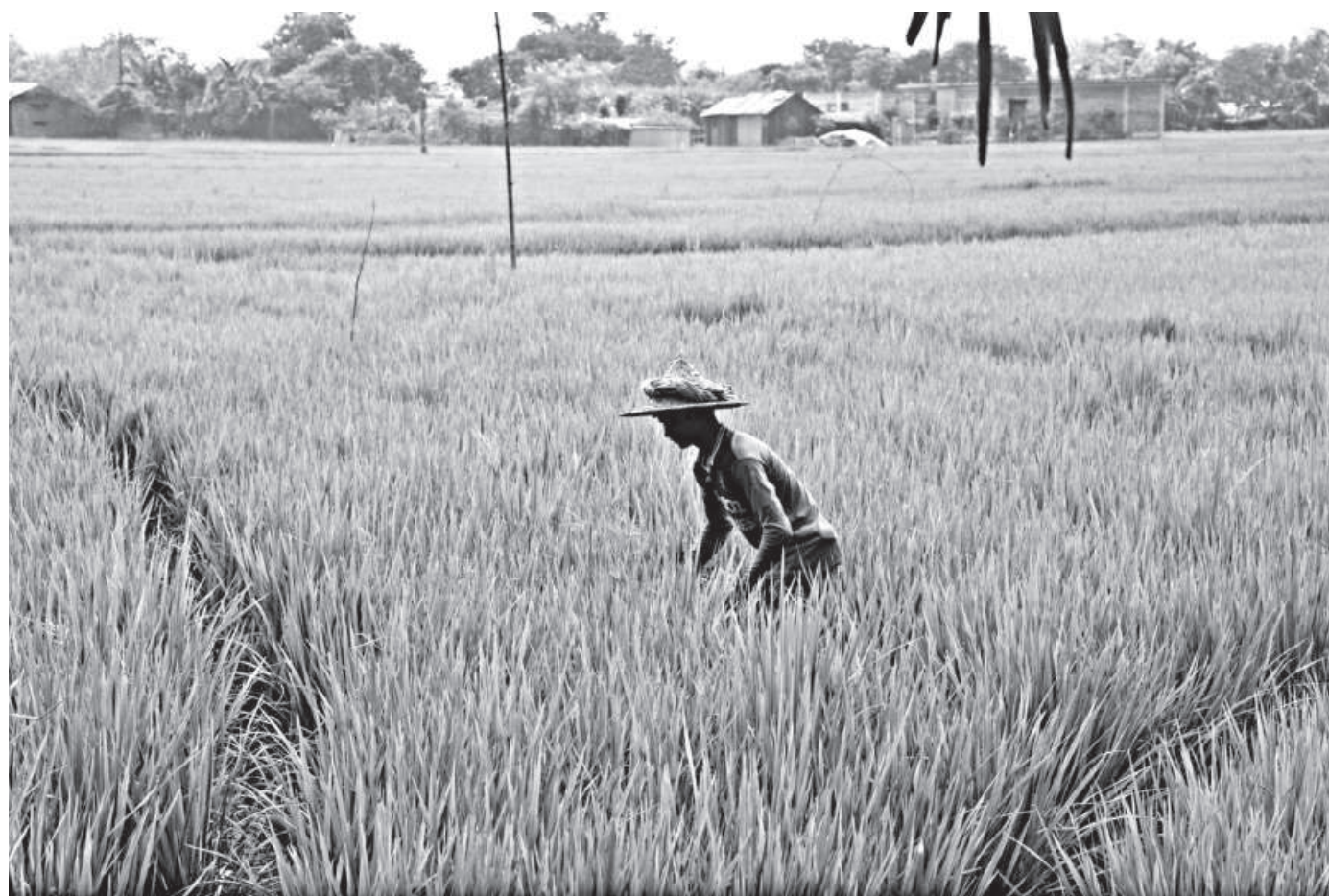
Farmers tend to their Aman paddy, keeping a close watch for pests and weed overgrowth. It will take another two months for the paddy to ripen before harvest. The photo was taken recently in the Sormongla area of Godagari upazila, Rajshahi.