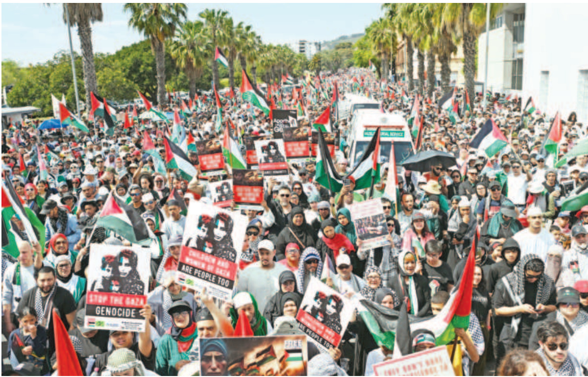
Protesters hold placards and Palestinian flags as they march through the city centre during a civil society and faith-based organisations' mass rally for Gaza in Cape Town, South Africa, yesterday.