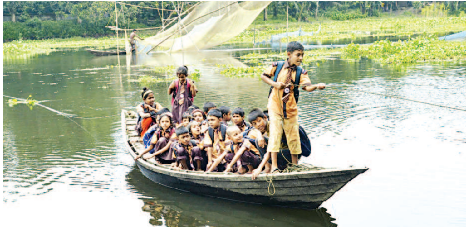
A schoolboy stands at the helm, not with oars but by gripping a rope tied to the riverbank, as he ferries his friends across the Shib river to Naogaon Govt Primary School in Rajshahi's Mohonpur upazila. A bamboo bridge built by locals collapsed years ago, and despite repeated promises, the authorities have yet to construct a permanent one. Due to the risky journey, attendance has sharply fallen as parents have stopped sending their children to the school. The photo was taken recently.