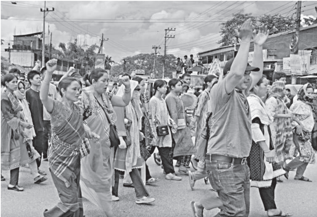
Hundreds of students and indigenous community members hold a mass rally in Khagrachhari yesterday, protesting the rape and ongoing violence against women in the Chittagong Hill Tracts.