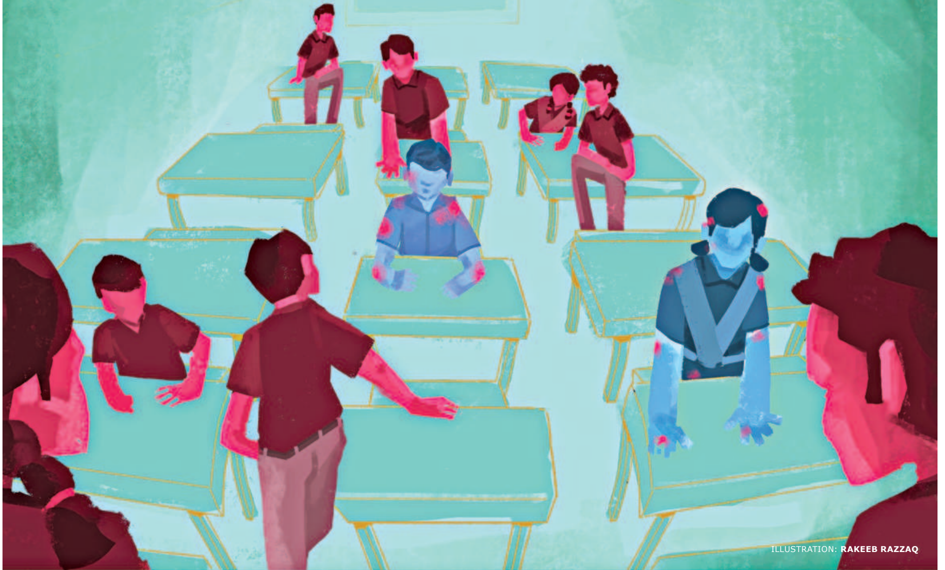
ILLUSTRATION: RAKEEB RAZZAQ