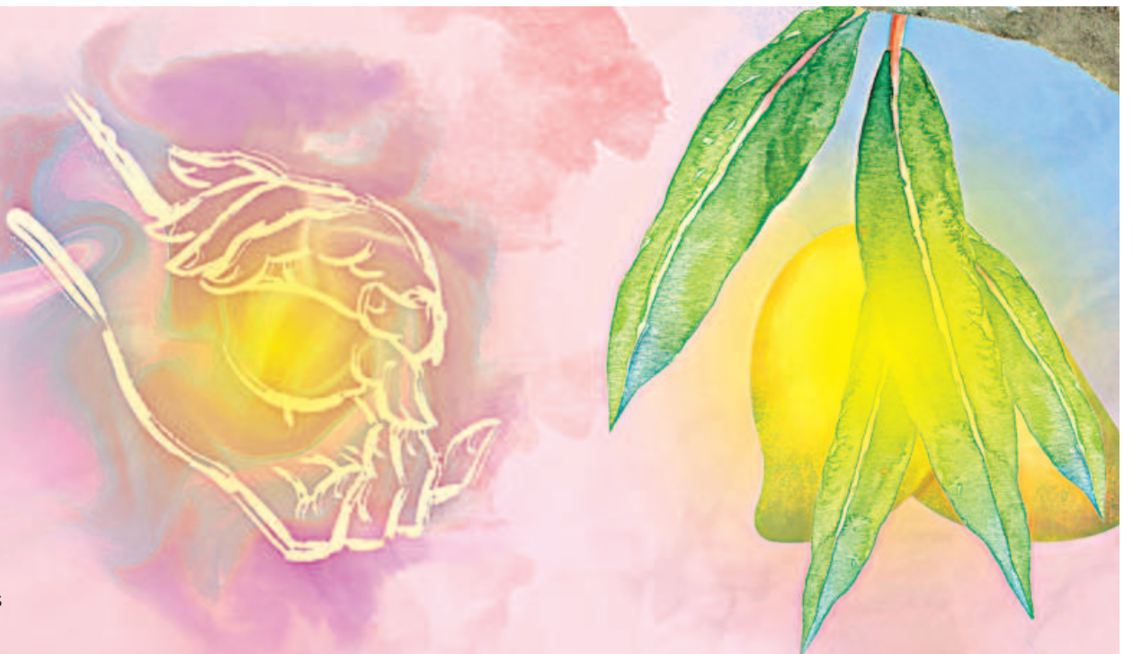
ILLUSTRATION: AZRA HUMAYRA

Azra Humayra is a sub-editor at Rising Stars.