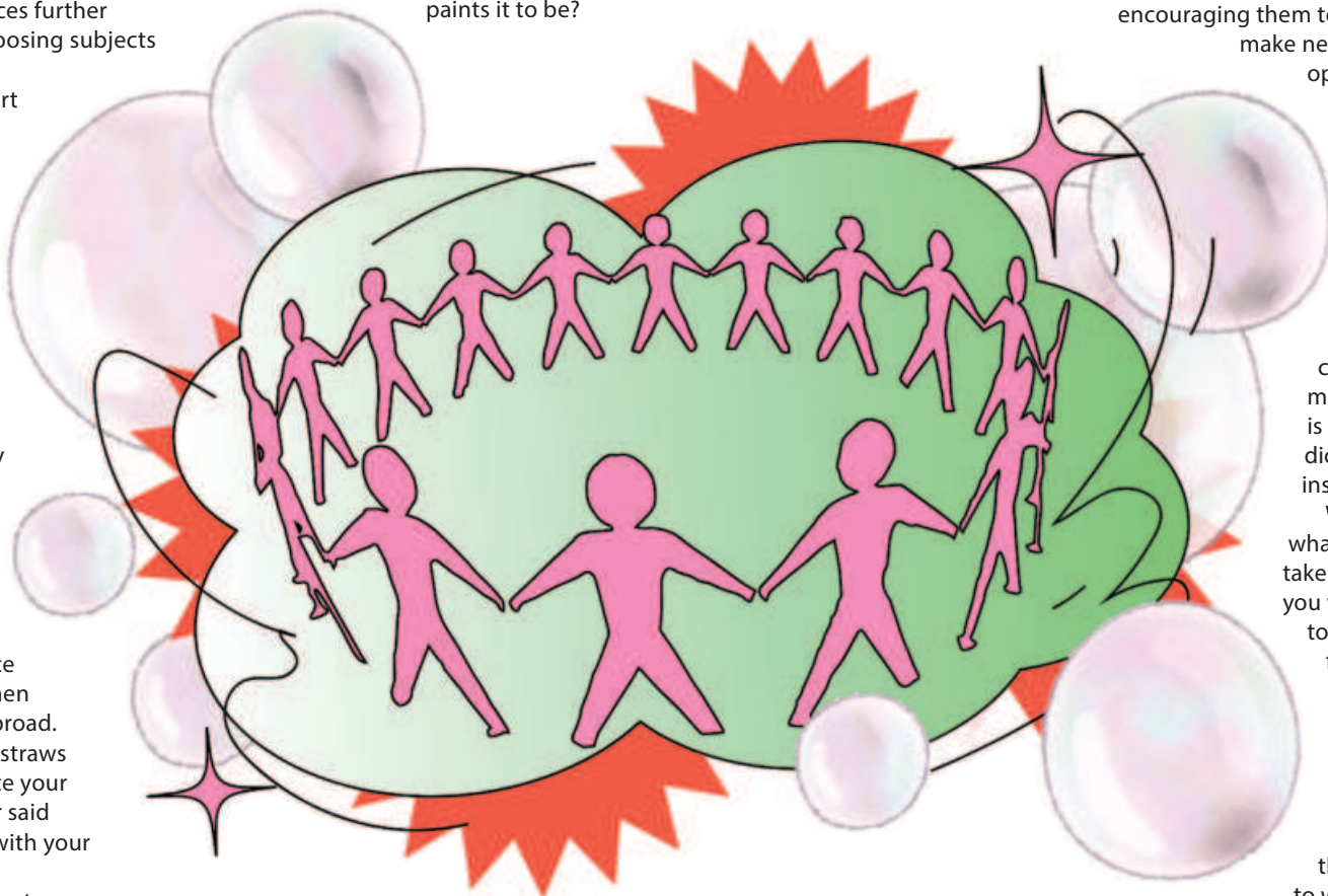
ILLUSTRATION: ABIR HOSSAIN

When you are truly sure what you wish to do in life, take that leap of faith. Maybe you will no longer be able to gossip with your best friend when the teacher isn't looking, but you can always catch up after classes. Compromises are a necessary part of growing up. Not everyone chooses the same path but that doesn't mean you have to walk alone. You'll always find new companions along the way.