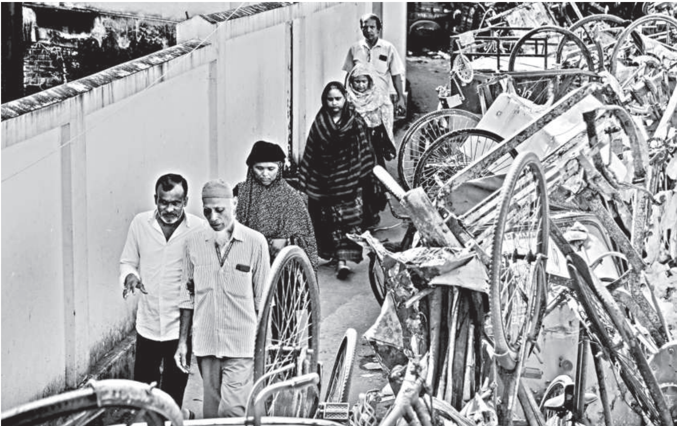
Abandoned vehicles seized in various cases lie rusting in the open on the Chattogram court premises, blocking movement and creating piles of junk that hold no resale value. The photo was taken recently.

"Jamuna's water level rose recently and then started to recede, causing erosion in the last few days. We are trying to begin riverbank protection work as soon as possible," he said.