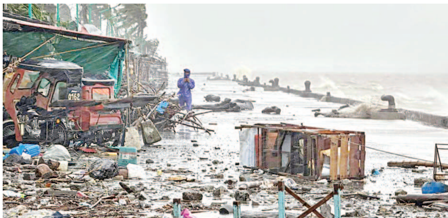
A man stands near debris on a waterfront road amid heavy rain caused by Super Typhoon Ragasa in Aparri town in the Philippines yesterday. The Chinese city of Shenzhen began preparing to evacuate 400,000 people while the typhoon made landfall in the northern Philippines, causing damage and casualties.

The protest was held over a ballooning scandal involving bogus flood-control projects believed to have cost taxpayers billions of dollars.