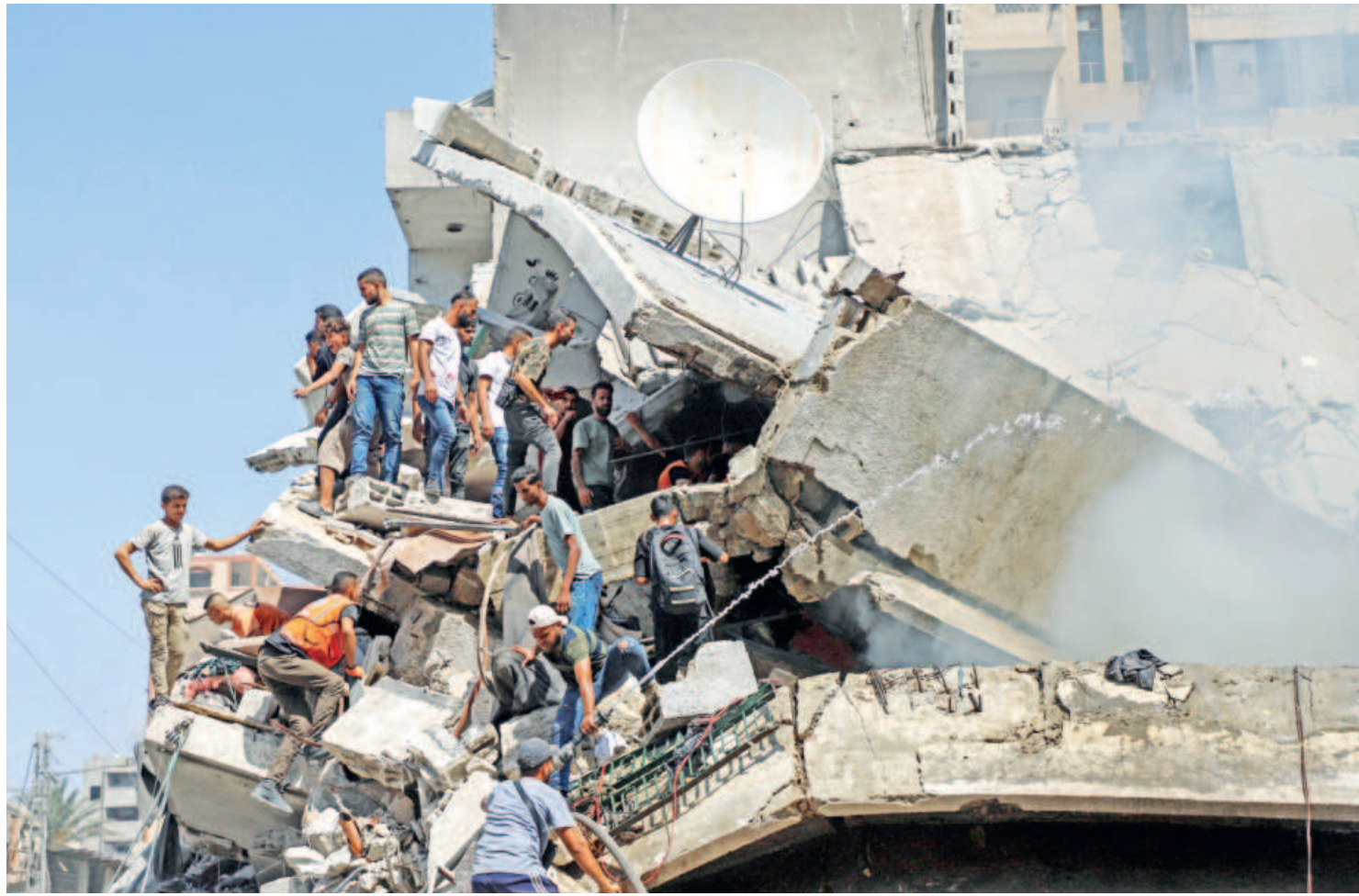
GAZA CARNAGE (From left, clockwise) Palestinians search for victims at a residential building after it was hit by an Israeli strike in Gaza City yesterday; a rescuer carries a wounded Palestinian girl as her mother tries to help her following the strike; and the father of the girl, who later died, cries during the rescue operation.