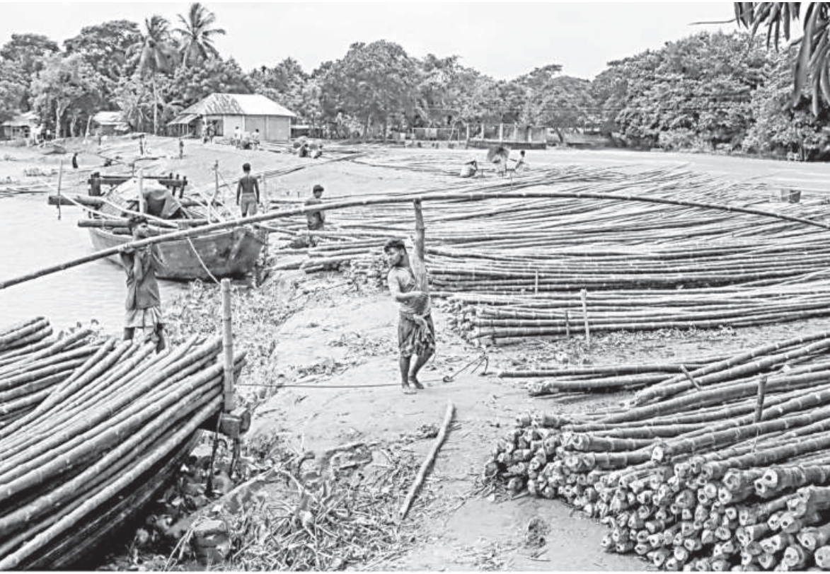
Traders bring bamboo by floating it down the Atai river to a weekly market at Abhaynagar in Jashore. Held every Wednesday, the market sells bamboo at wholesale prices ranging from Tk 150 to Tk 600 per pole. The photo was taken recently.

The police officer told reporters that the family did not file any case or complaint regarding the accident. "So, we handed over the body to them."