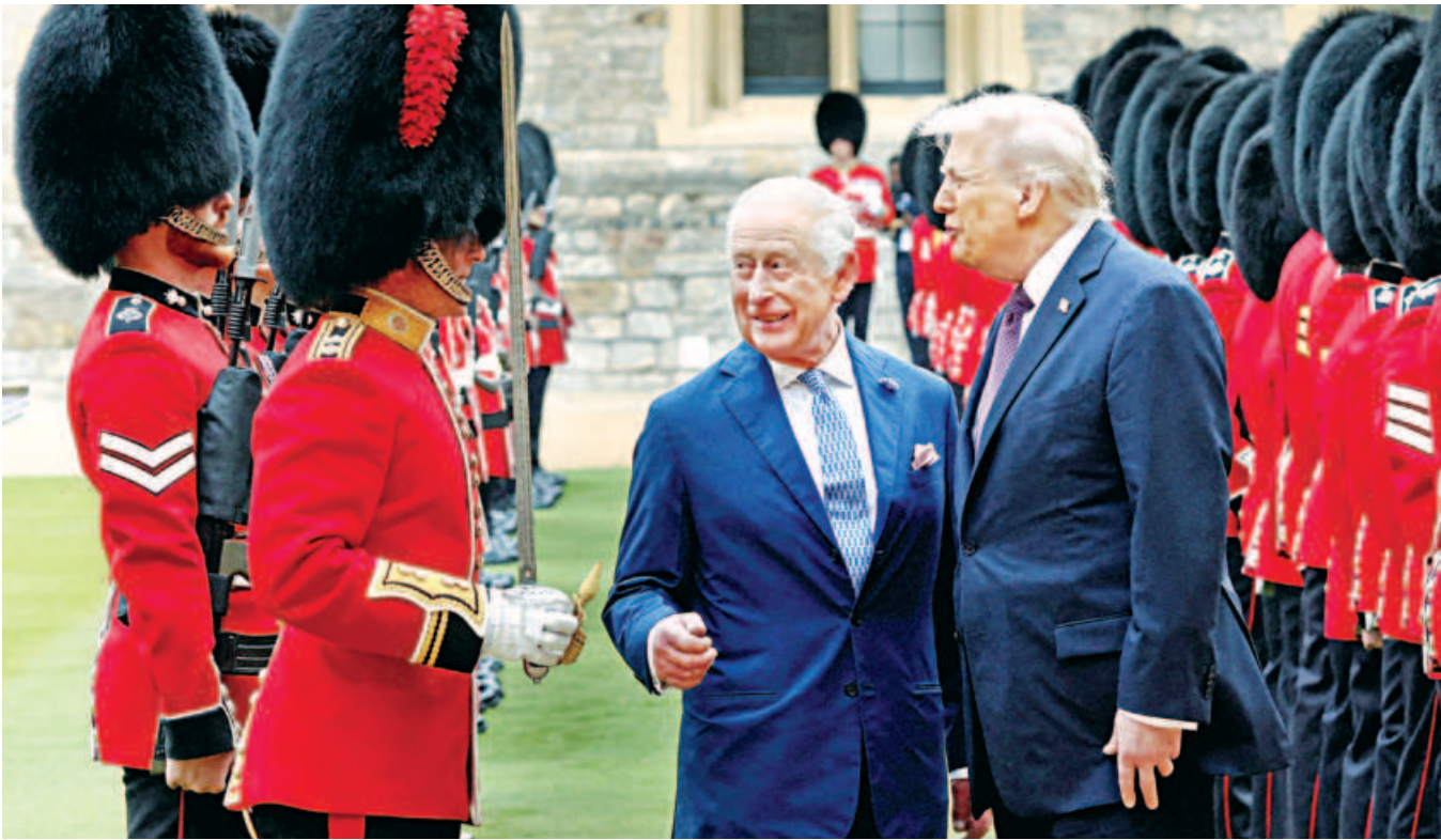
US President Donald Trump and Britain's King Charles inspect the Guard of Honour as they attend a welcome ceremony during Trump's state visit, at Windsor Castle, in Windsor, Britain, yesterday.

They could also agree a defence and security partnership, as the EU already has with Japan and South Korea, and cooperate in projects in third countries, particularly in Africa and South Asia.