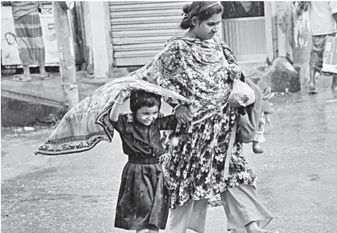
A schoolgirl, sheltered under her mother's scarf, returns home joyfully in the rain after classes yesterday. The photo was taken at Amanatganj intersection in Barishal city.