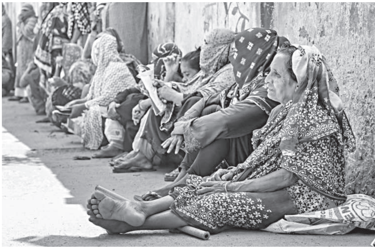
Low-income people wait from dawn to buy rice and other essentials at fair prices from an OMS dealer on Boundary Road near Boyra College in Khulna. The long wait is especially hard for elderly women and children. The photo was taken recently.