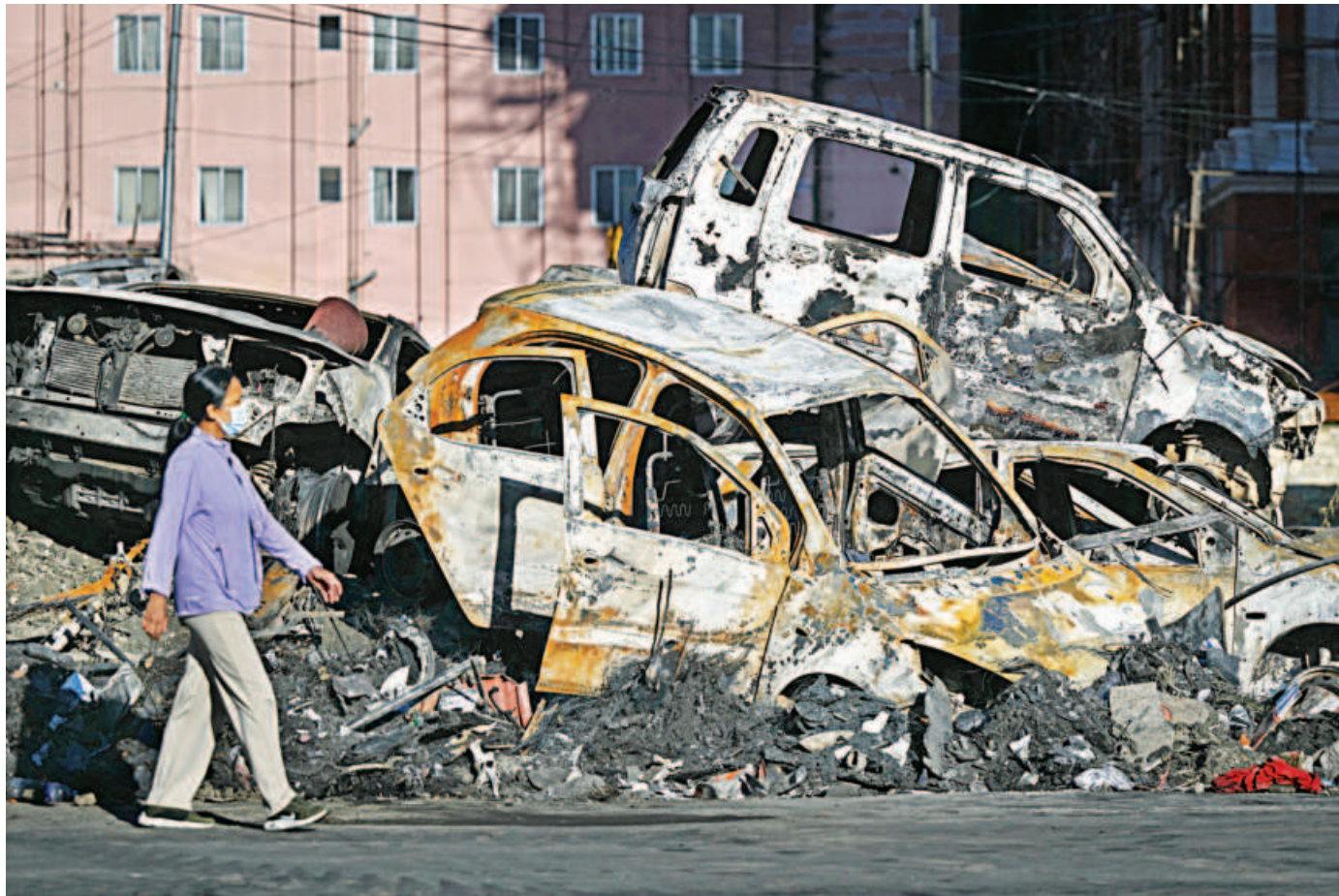
Charred vehicles are seen outside the Supreme Court during a curfew imposed to restore law and order in Kathmandu, Nepal, yesterday.