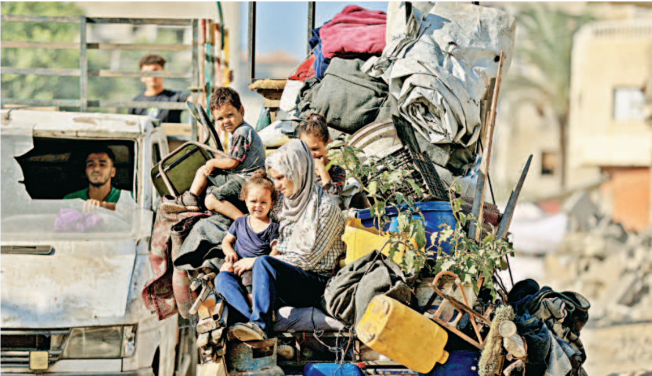
Displaced Palestinians flee amid an Israeli military operation, after Israeli forces ordered residents of Gaza City to evacuate to the south. The photo was taken in Gaza City yesterday.