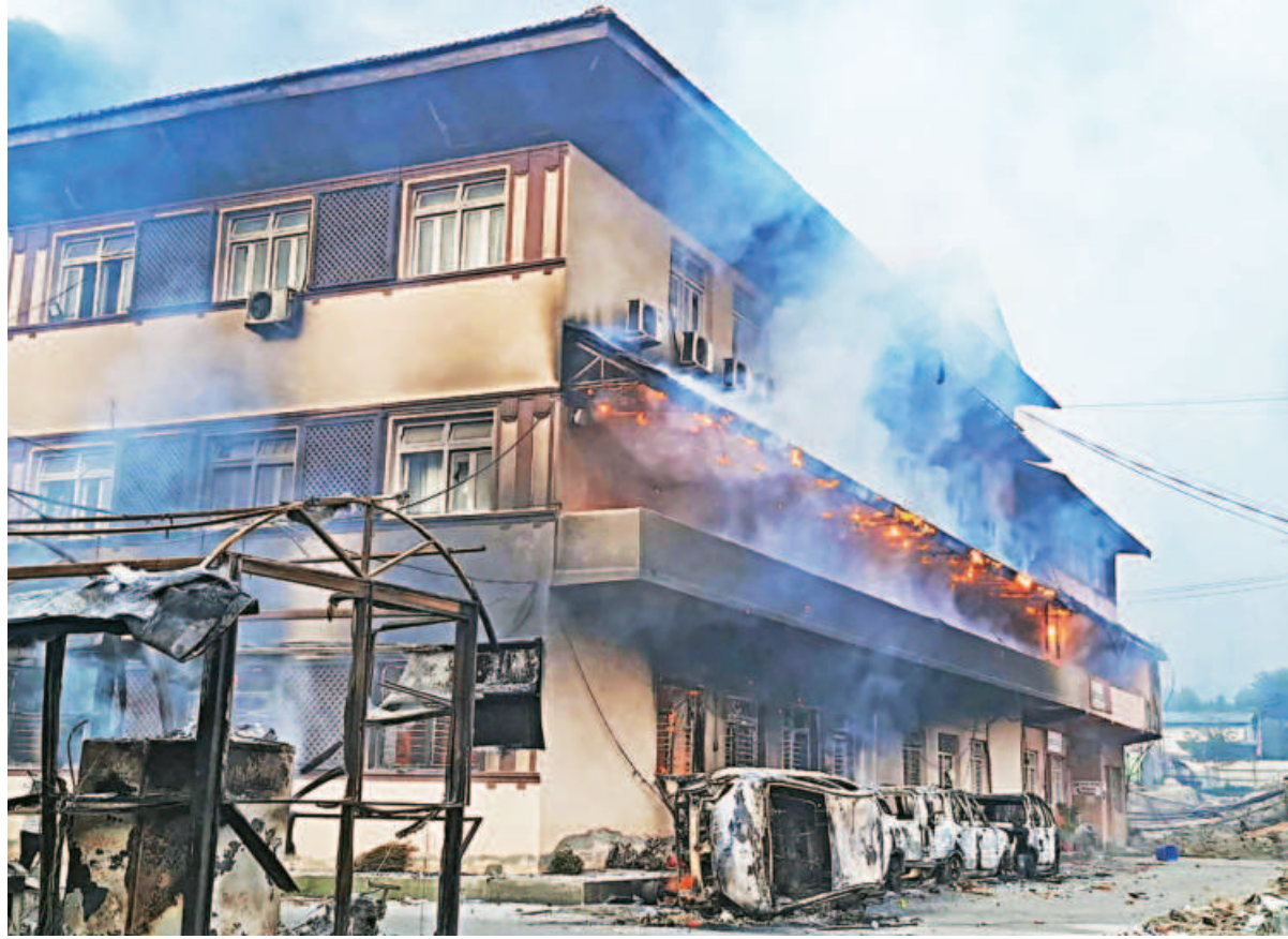
Smoke billows from the Supreme Court building, set ablaze by protesters in Kathmandu yesterday; protesters walk with looted items from Singha Durbar, the main administrative building of the Nepal government; and young people celebrate after the fall of the government in Nepal.

The embassy is geared to arrange the safety of its citizens, it said. However, there are no plans to evacuate its diplomatic staff, it added.