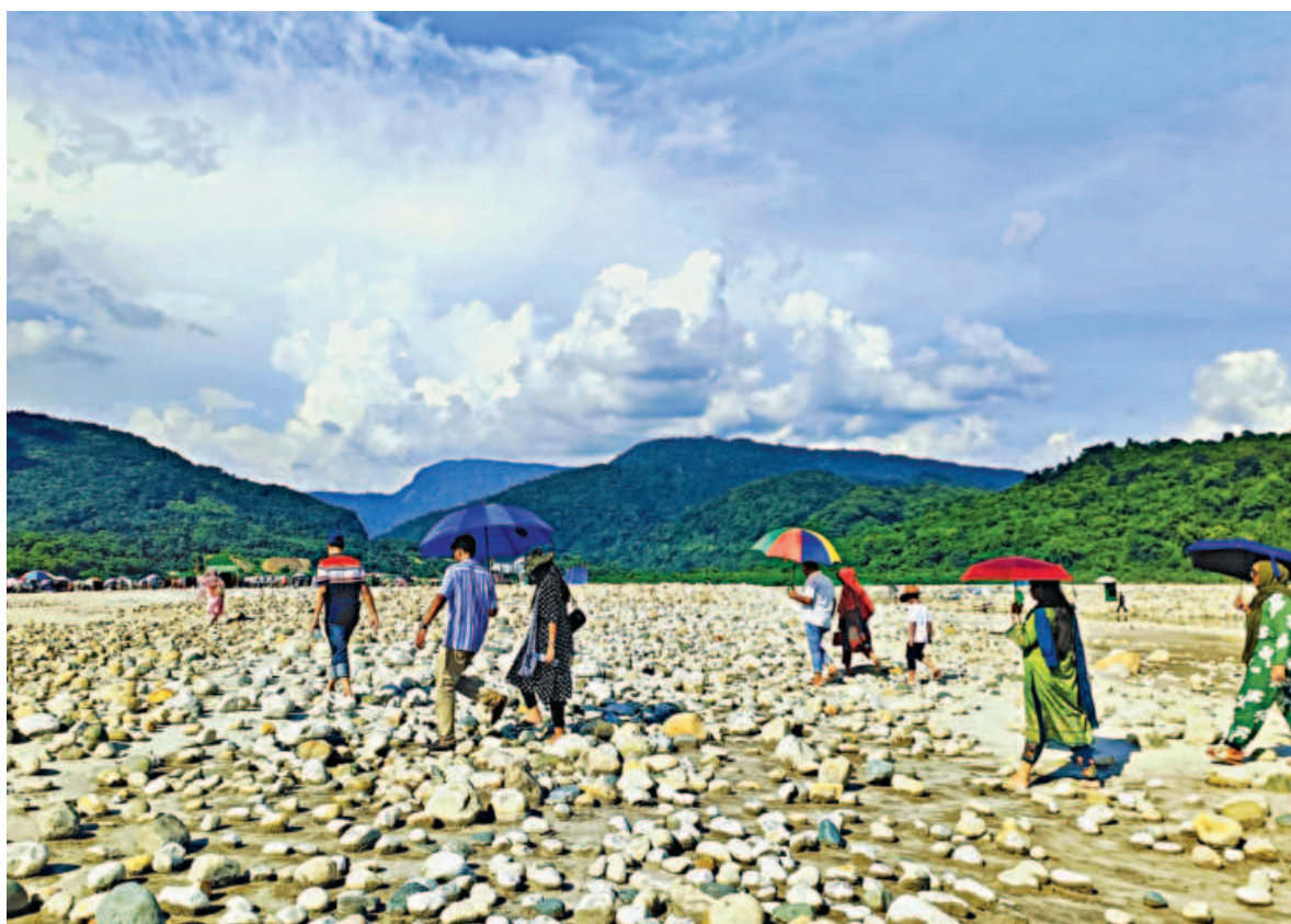
The Bhologanj Sada Pathor tourist spot in Sylhet's Companiganj upazila has regained its natural charm, as white stones earlier looted were recovered by different organisations and reinstalled, restoring the site's scenic beauty.