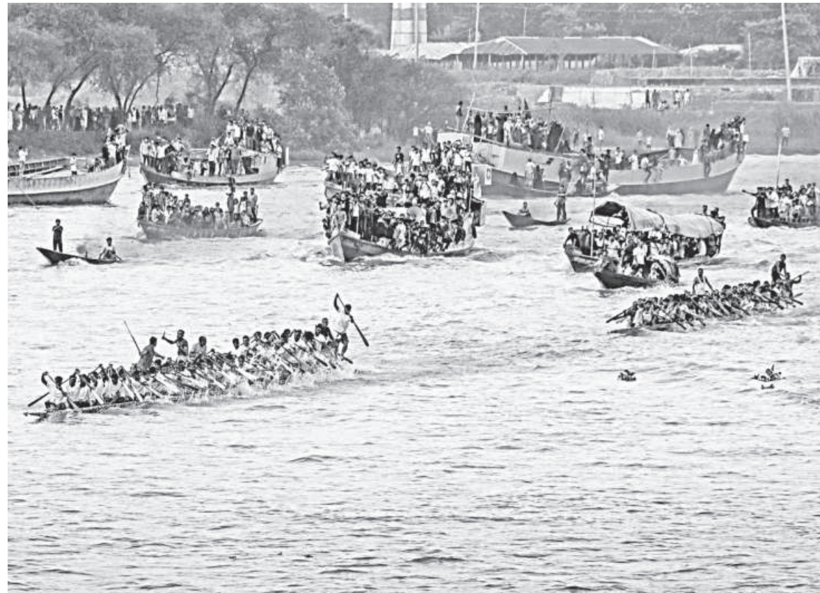
Boatmen from Narail, Khulna and Gopalganj districts are busy competing in a traditional boat race in Khulna. Thousands of spectators from nearby districts gathered on both banks of the river to watch the competition. The race started from Baraipara ferry ghat and finished at Kanchanpur.