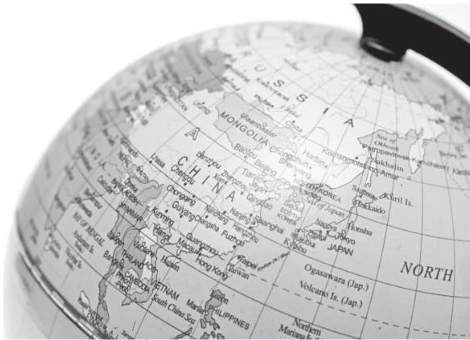
If the ‘unipolar moment’ is fading, what replaces it may not be a balanced bipolar order but a new unipolarity—this time with Beijing at the helm.

If the “unipolar moment” (Krauthammer) is fading, what replaces it may not be a balanced bipolar order but a new unipolarity—this time with Beijing at the helm. Such a system would not replicate the liberal international order but embody a different logic: infrastructural dependency, sovereign hierarchies, state-managed capitalism, and a developmentalist ideology privileging stability over liberty. We are moving not to a postimperial vacuum but to the emergence of another empire. The language of multipolarity risks obscuring this trajectory, mistaking transitional turbulence for equilibrium. The tectonic shift is gaining momentum as India gradually tilts towards China, its formidable neighbour, driven by the perceived unreliability of its traditional ally, the US. The 21st century’s centre of gravity is quietly shifting from Washington to Beijing, signalling the rise of a China-centric order anchored in infrastructure, technology, and state-managed capitalism.