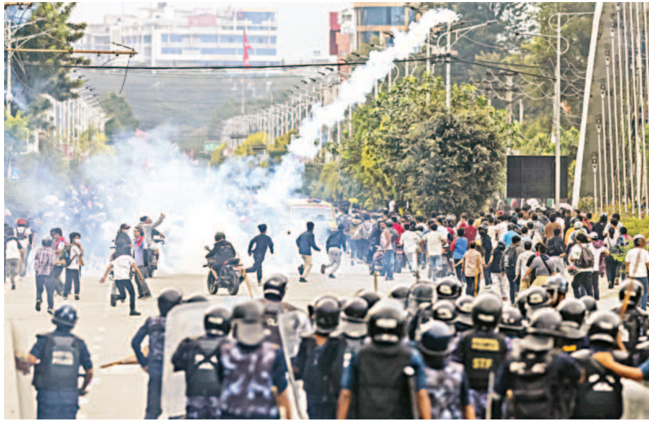
Riot police personnel fire tear gas to disperse demonstrators during a protest outside the parliament in Kathmandu yesterday; protesters carrying Nepal's national flag try to storm the parliament; and protesters carry an injured victim during the protest.