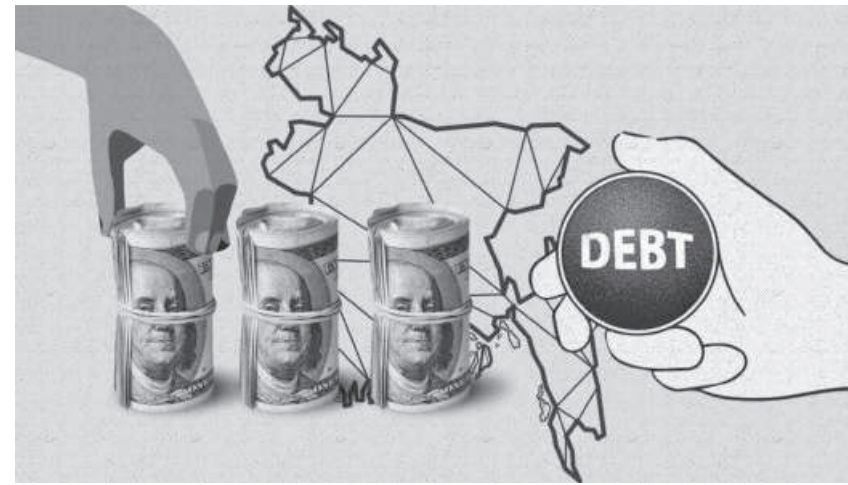
VISUAL: ANWAR SOHEL

High levels of debt constrain a government's capacity to invest in essential development areas, such as