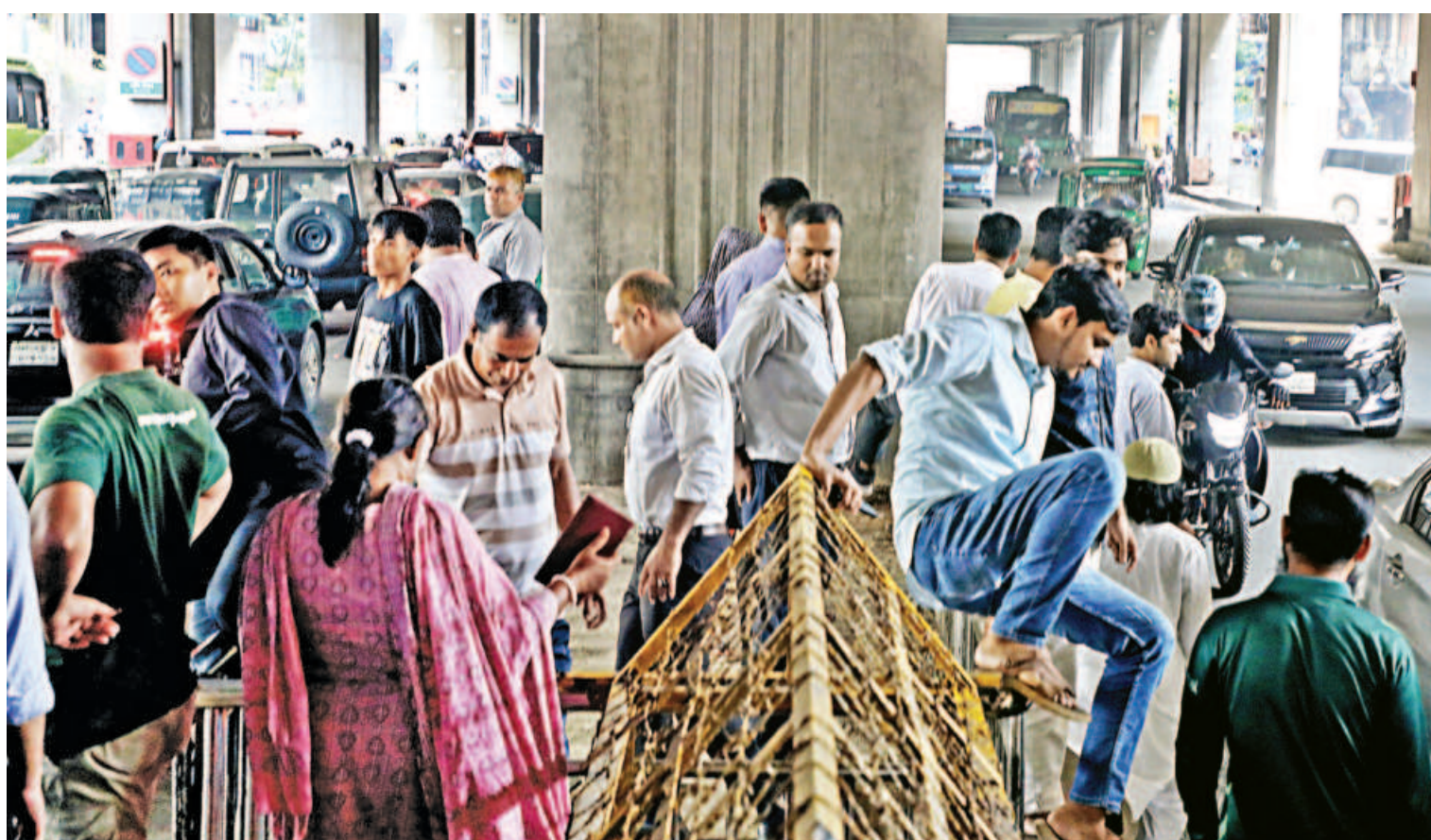
A man clammers over a police barricade placed in the middle of the road to prevent jaywalking and unsafe crossings. Many others around him also disregard the barrier and walk past it, despite a foot-over bridge being only a short distance away. Such reckless actions often lead to accidents. The photo was taken recently from underneath the Kawran Bazar Metro Rail Station yesterday.