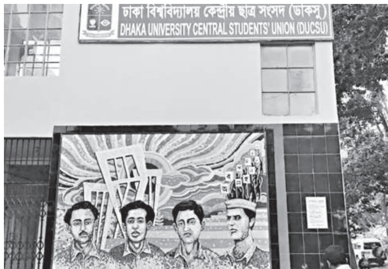
This year, our vote could matter, not just for the Ducsu, but also for the future of this university.

Last week, when I went to DU for my internship registration, I noticed the conversations. Students are curious, cautious, and excited. There is no cynicism, at least not the kind that paralyzes action. So, yes, this year, our vote could matter, not just for the Ducsu, but also for the future of this university. It is time to turn up and make a difference.