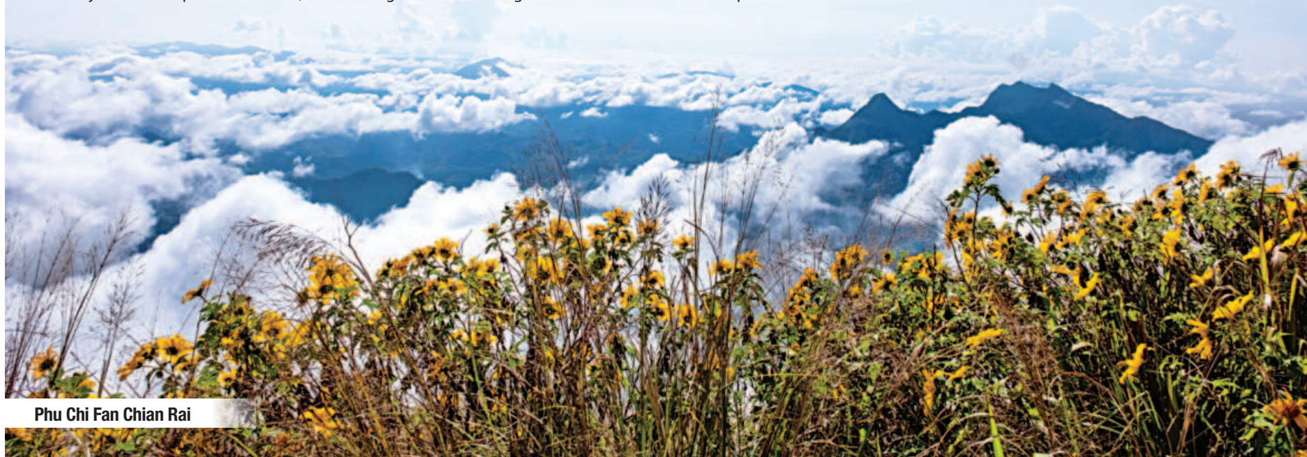
Phu Chi Fan Chian Rai