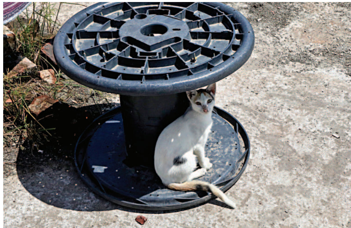
A stray cat takes shelter from the scorching sun beneath a life-size spool on the rooftop of a factory building. The ongoing heatwave over the past week has left many struggling to cope with daily life. The photo was taken at Lalbagh in Old Dhaka yesterday.