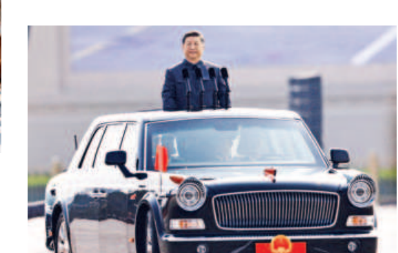
Chinese militia members march during a military parade to mark the 80th anniversary of the end of World War Two, in Beijing, China, yesterday. Inset , President Xi Jinping stands in a car to review the troops during the military parade.