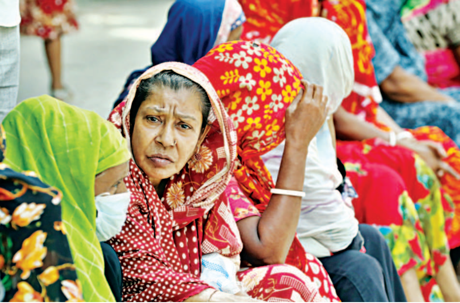
Women wait for nearly four hours under the scorching sun in Mohammadpur yesterday for a TCB truck that was scheduled to arrive at 9:00am but had yet to come even by 1:00pm. For many, these trucks are the only way to buy essentials at affordable prices.

STAR REPORT Authorities at Rajshahi University’s (RU) July 36 Hall have withdrawn a notice summoning 91 female students for returning to their dormitory after 11:00pm, following widespread criticism from students and on social media. The original notice, signed by hall provost Prof Lovely Nahar on Monday night, instructed students listed under serial numbers 1-45 to appear at her office on September 9, and numbers 46-91 on September 10. The move quickly sparked a debate online, with many terming it “illogical” and “discriminatory”. A fresh notice was issued yesterday afternoon, announcing the withdrawal. Students said the publication of their names exposed them to humiliation and safety risks. “Our personal information is now out in the open. I was marked for returning late one night, but I had only stepped out briefly to collect food. Now others are making indecent remarks about us,” said a resident. Another student said, “This was done in the name of security, but instead it put us in danger. With the upcoming Rucusu polls, such information can easily be misused. The administration acted unprofessionally.” The controversy also drew attention from student SEE PAGE 4 COL 4