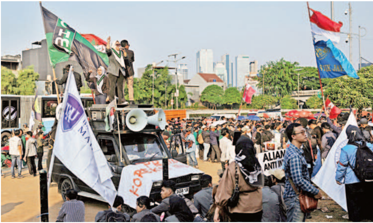
University students protest outside the Indonesian Parliament building in Jakarta yesterday, opposing lawmakers' extra pay and housing allowances.