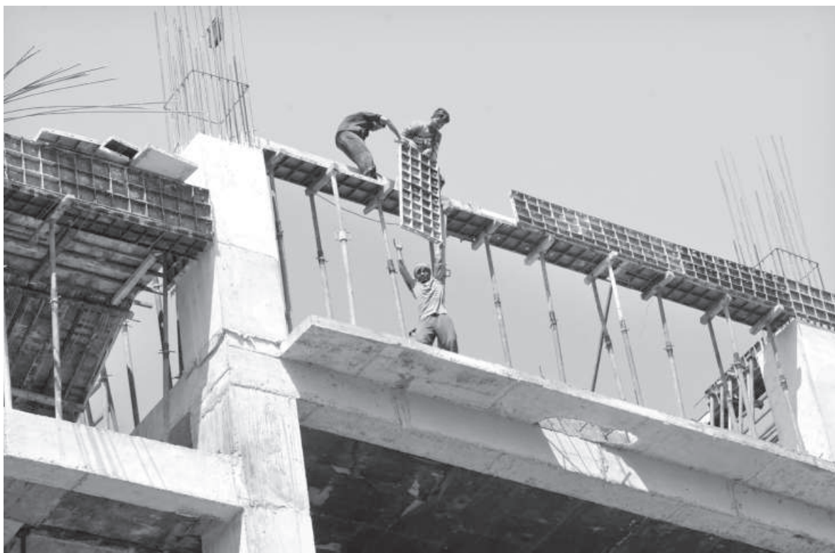
Workers at the Rajshahi University of Engineering and Technology construction site carry out their tasks without any safety equipment, exposing themselves to serious risks. A minor slip or error on this multi-story building could have fatal consequences.