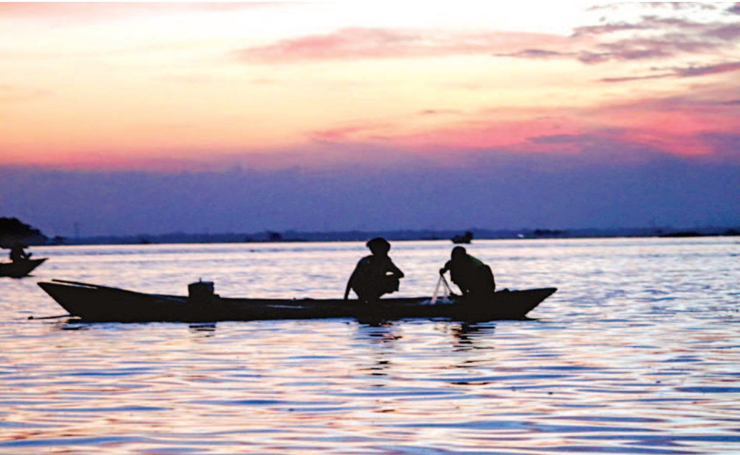
As the sun dips below the horizon, two fishermen set out on their boat across the tranquil waters of Itna Haor in Kishoreganj. The evening casts a golden glow over the haor, where many locals rely on fishing for their livelihood, working from dusk into the night.