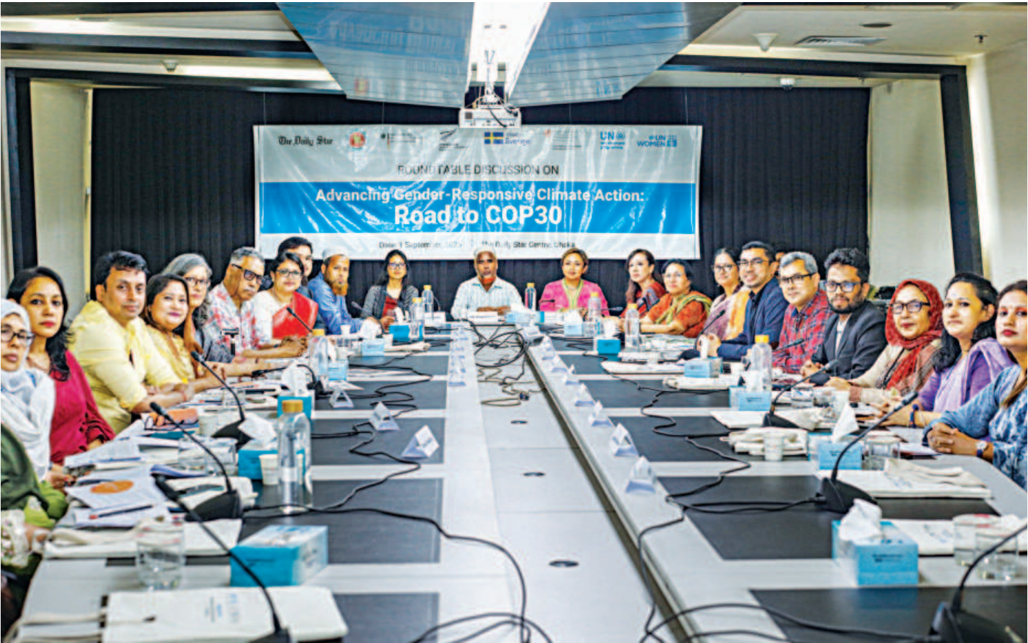
Speakers at a roundtable, titled “Advancing Gender-Responsive Climate Action: Road to COP30”, jointly organised by UN Women and The Daily Star at the capital's The Daily Star Centre yesterday.