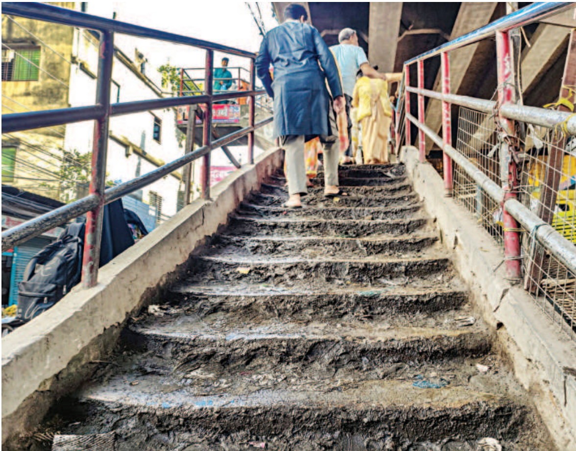
The broken and slippery staircase of Babubazar Bridge beside Sir Salimullah Medical College in Old Dhaka remains a daily hazard for thousands commuting between Dhaka and Keraniganj due to poor maintenance. The photo was taken yesterday.