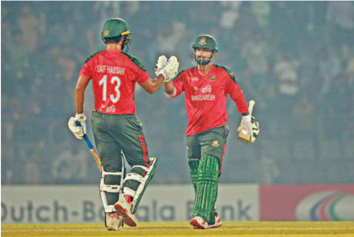
Bangladesh captain Litton Das and Saif Hassan celebrate their eight-wicket victory over the Netherlands in the first of three T20Is at the Sylhet International Cricket Stadium yesterday. Both Litton (54 off 29) and Saif (36 off 19) stayed unbeaten, but the winning foundation was laid by pacer Taskin Ahmed's four wickets off 28 balls, with Saif also contributing with two key top-order dismissals, after the hosts chose to field.