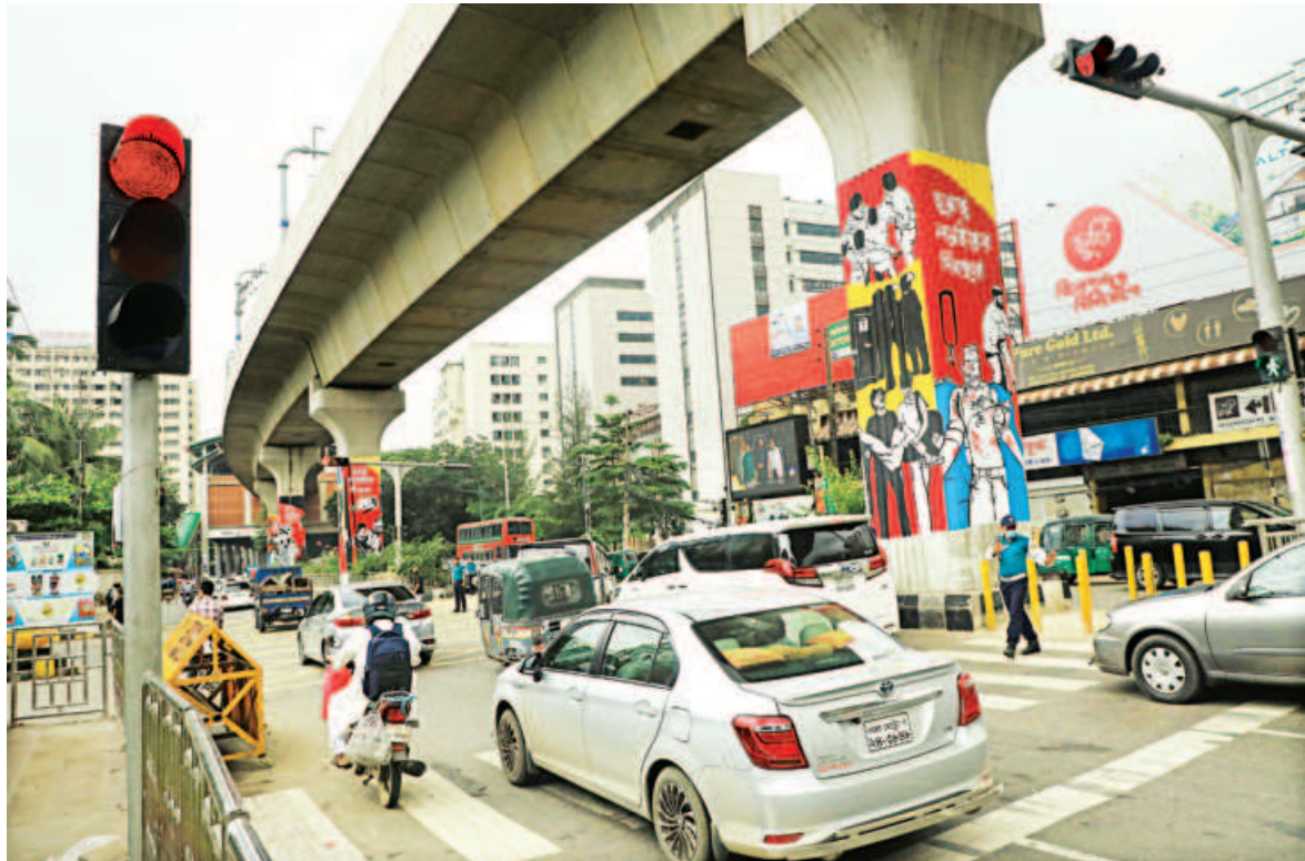
The government's pilot programme to install semi-automatic traffic signals at seven intersections in Dhaka began yesterday. This photo, taken on the capital's Minto Road near Hotel Intercontinental, shows commuters ignoring the red signal and passing through.