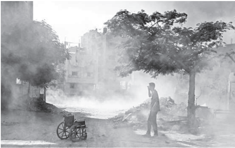
A Palestinian man stands next to an empty wheelchair following an explosion in the Saftawi neighbourhood, west of Jabalia in the northern Gaza Strip on August 25, 2025.