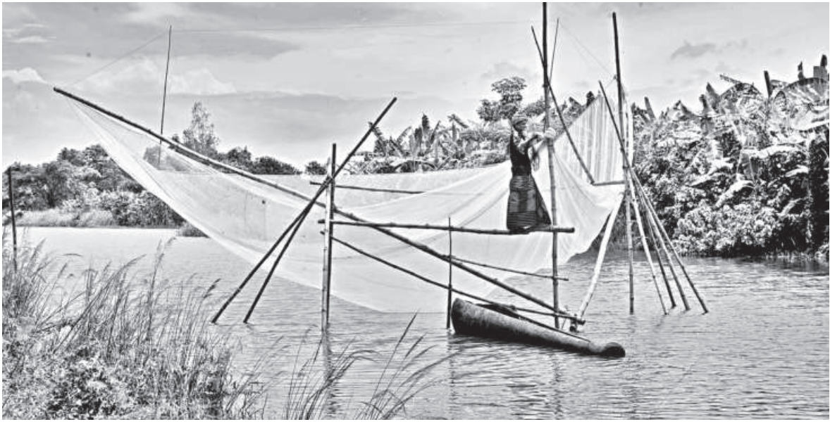
A fisherman casts a large net to catch native fish in an old canal in Rajshahi yesterday. With water receding from waterbodies, fishers are busy capturing as much fish as possible before levels drop further. The photo was taken near the new Bagdhani Bridge area in Paba upazila.

At the seminar, Prof A K Enamul Haque, director general of BIDS, said women's participation in the workforce drops sharply when they have children under five and stressed the need for accessible day care centres. He noted that Western-style daycare centres in garment factories often failed because mothers could not bring their children to the facilities, even though the centres were well-equipped. Accessible and well-located daycare centres are key to increasing women's workforce participation, he said, adding, “Evidence shows that centralised factory-based centres often fail, whereas location-based centres near homes are far more effective for working mothers.” Prof Enamul also pointed to unreliable and unsafe urban transport system as another major barrier preventing women from taking up jobs. Navanita Sinha, deputy representative of UN Women, said investing in basic care services can yield significant returns, citing OECD research that showed 30-40 percent gains in women's employment. She expressed hope for similar evidence from Bangladesh. She also emphasised that care is a complex issue that requires both quantitative and qualitative research to be fully understood.