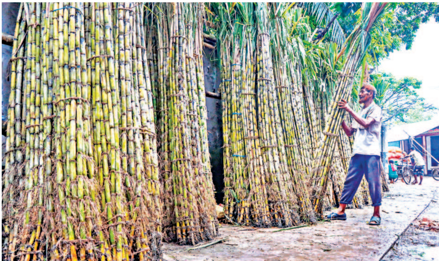
A man arranges freshly cut sugarcane in rows, preparing it for sale. Wholesale traders collect the stalks from the fields, bundle them, and keep them ready for the market. Depending on size and quality, each hundred stalks of sugarcane sells for Tk 1,500-6,000. The photo was taken recently at Boro Bazar market in Khulna city.