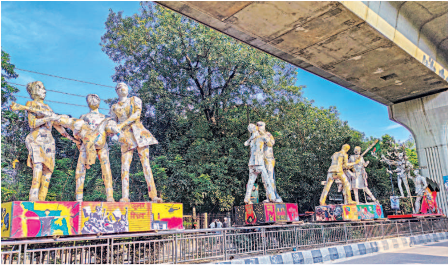
These sculptures, made using a combination of metal, wood, and paper, depict the many tragedies and atrocities that took place during the July uprising last year. Some show the police brutality that protesters endured, while others depict victims being carried away by those around them. The installation was created by artists from the Faculty of Fine Arts at Dhaka University and was displayed recently opposite their department.