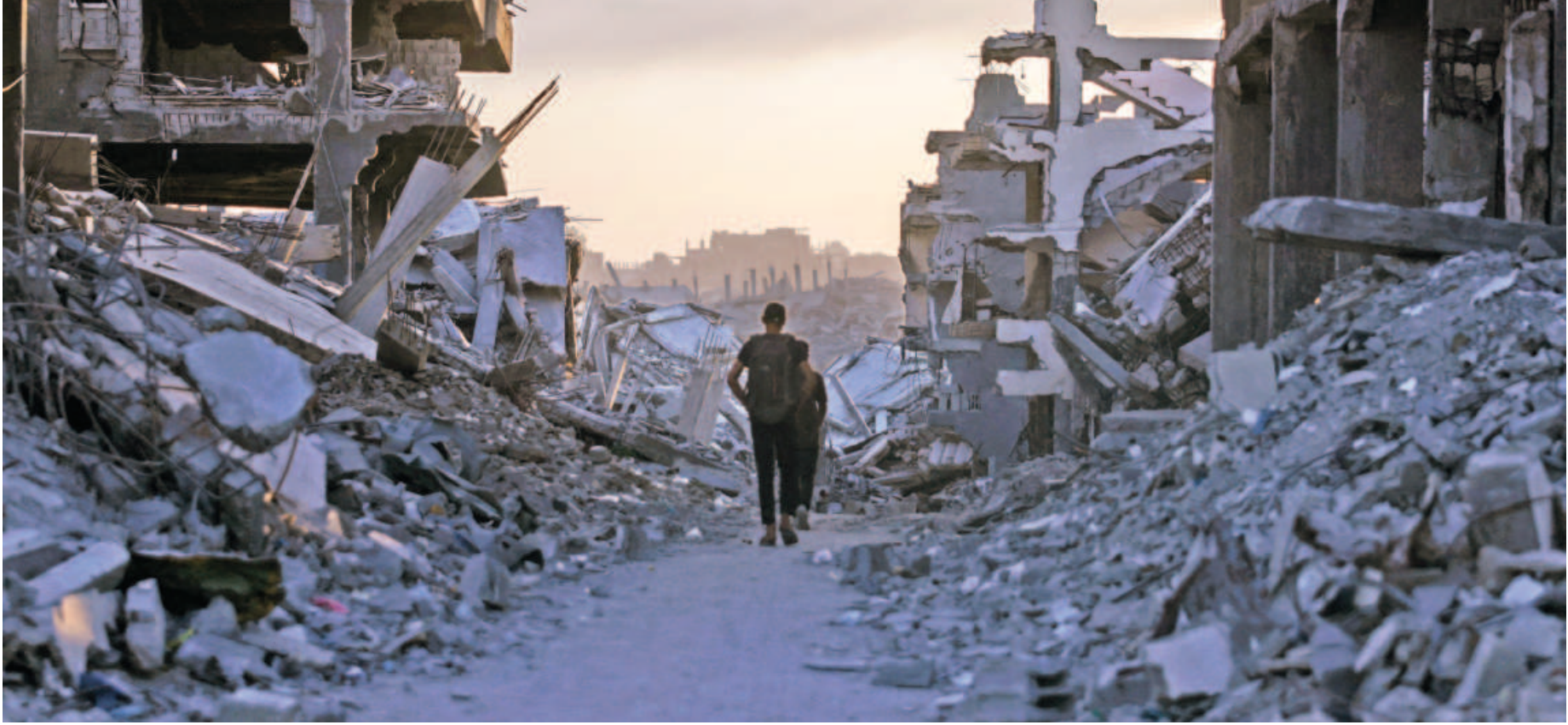
A man walks between piles of rubble in Saftawi neighbourhood, west of Jabalia in the northern Gaza Strip, on August 24, 2025, amid the ongoing brutal Israeli aggression on the Palestinian territory.