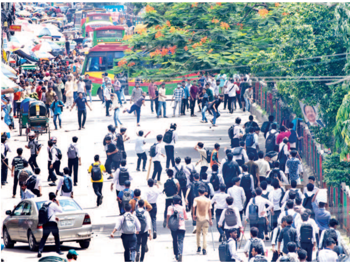
A clash broke out between the students of Dhaka College and Dhaka City College in the Science Lab area of the capital yesterday afternoon, leaving at least seven persons injured.