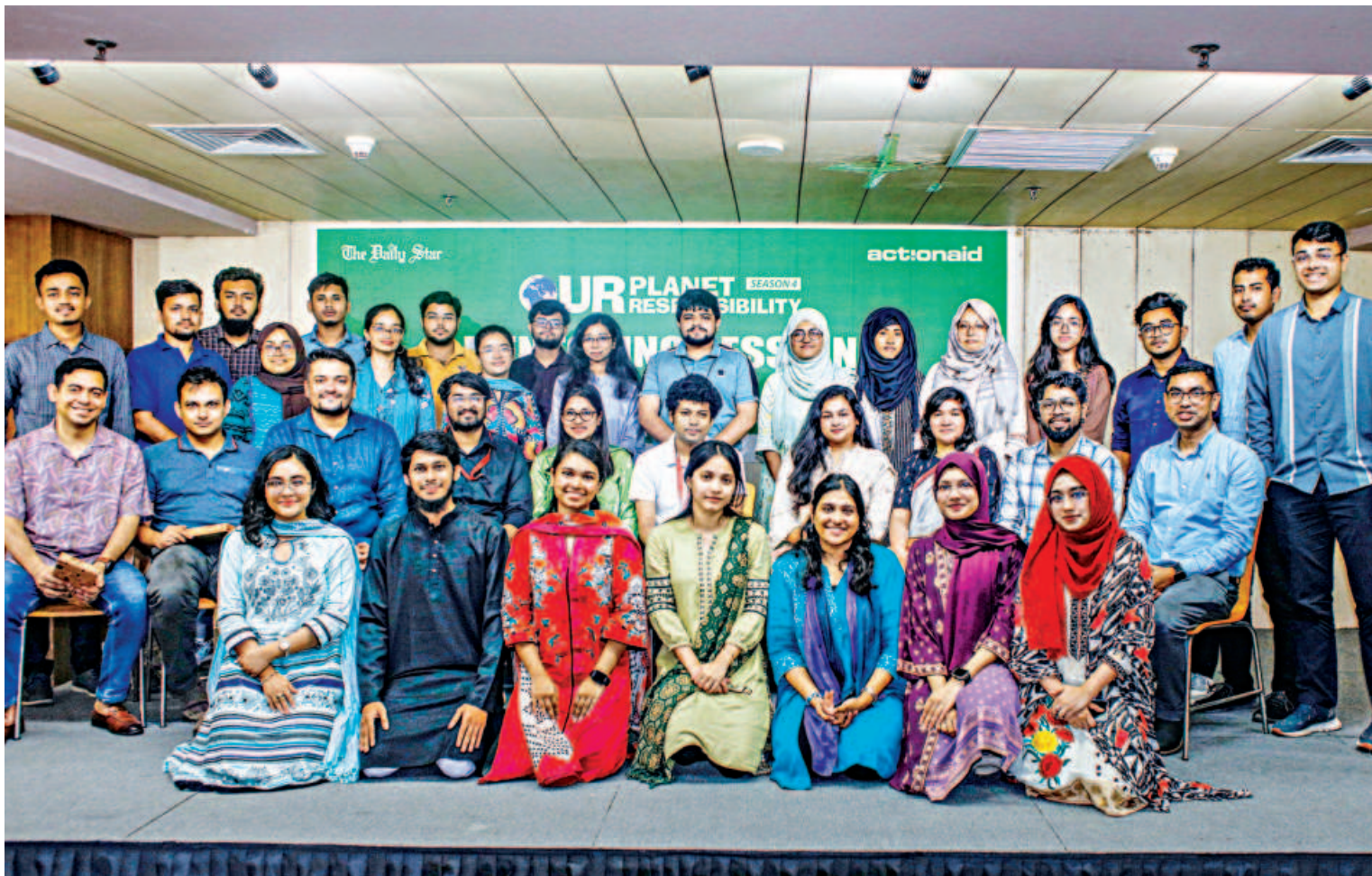
The Daily Star and ActionAid Bangladesh are jointly organising Season 4 of "Our Planet, Our Responsibility". A Mentoring session was held for the nine finalist teams selected under three categories -- Green Business, Water Rights, and Energy Transition -- at The Daily Star Centre in the capital yesterday. On August 23, the finalist teams will present their ideas to the judges as they compete for the championship title.

General Waker is scheduled to return home on August 27.