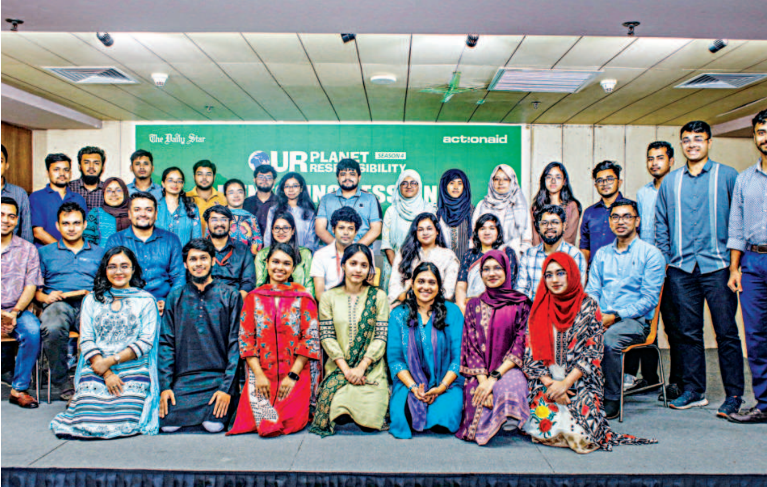
The Daily Star and ActionAid Bangladesh are jointly organising Season 4 of "Our Planet, Our Responsibility". A Mentoring session was held for the nine finalist teams selected under three categories -- Green Business, Water Rights, and Energy Transition -- at the capital's The Daily Star Centre yesterday. On August 23, the finalist teams will present their ideas to the judges as they compete for the championship title.

Chief of Army Staff General Waker-Uz-Zaman left Dhaka yesterday morning for a four-day state visit to China. According to an Inter-Services Public Relations (ISPR) statement, he will hold courtesy meetings with senior civilian and military officials in Beijing and discuss ways to enhance bilateral military cooperation. General Waker is scheduled to return home on August 27.