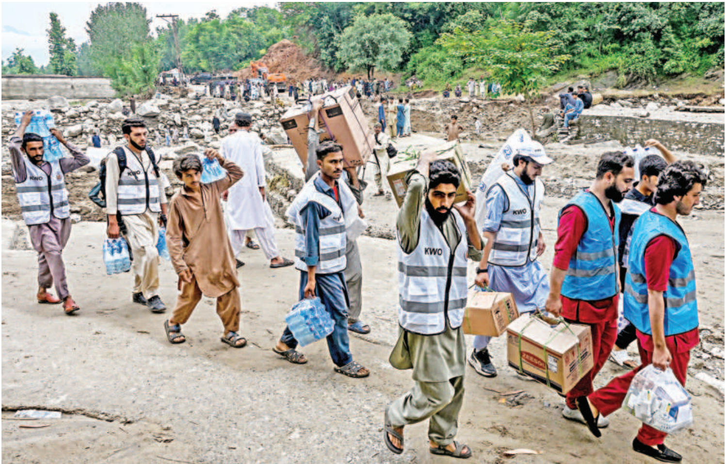
Volunteers carry food and medical supplies for flood victims in the Buner district of Pakistan's mountainous Khyber Pakhtunkhwa province yesterday. Pakistani rescuers dug through debris and massive boulders in search of survivors after flash floods killed at least 344 people, with more than 150 still missing.

Beyond attacks on Israel, Houthis have also targeted alleged Israeli-linked ships in the Red Sea and Gulf of Aden off Yemen. The Iran-backed group broadened its campaign to target ships tied to the US and UK after the two countries began military strikes.