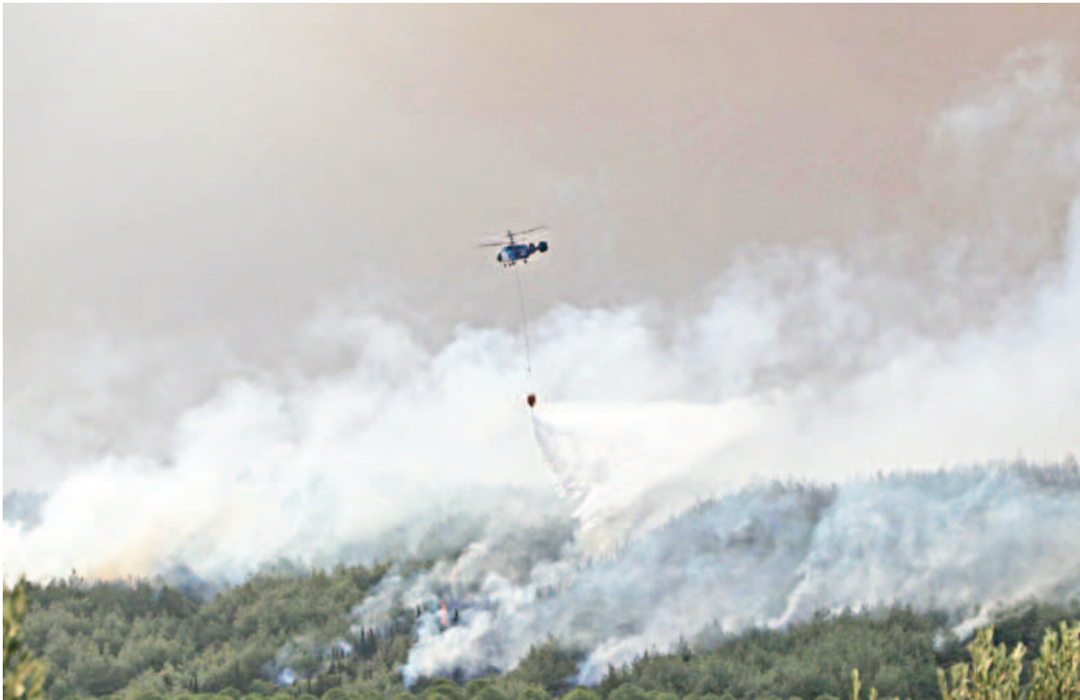
This handout photograph, taken and released yesterday by Turkish news agency DHA, shows a firefighting plane spraying water over a scorched area following a wildfire in the Gelibolu district of Çanakkale, northwestern Turkey.

This continued till May 10, when Pakistan approached the Indian side and requested a ceasefire. However, Trump claimed that the hostilities ended due to his involvement that came with a tariff threat - a claim that India has denied multiple times.