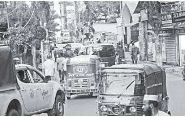
A congested Love Lane.