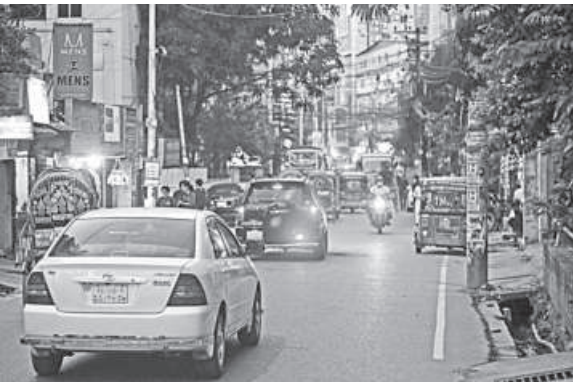
Mehedibagh Road in port city.