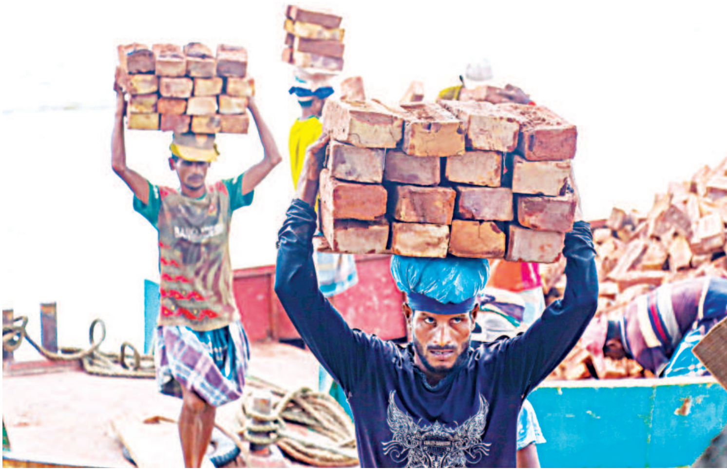
Workers unload bricks from a vessel in Khulna. They have to work fast to take advantage of the low tide and this leaves them vulnerable to the risk of accidents. Working from morning till afternoon, each person can earn anywhere from Tk 600 to Tk 700. The photo was taken at No 1 Custom Ghat at the end of last month.

Current and former employees of OpenAI are looking to sell nearly $6 billion worth of the ChatGPT maker's shares to investors including SoftBank Group and Thrive Capital, a source familiar with the matter told Reuters on Friday. The potential deal would value the company at $500 billion, up from $300 billion currently, underscoring both OpenAI's rapid gains in users and revenue, as well as the intense competition among artificial intelligence firms for talent. SoftBank, Thrive and Dragoneer Investment Group did not immediately respond to requests for comment. All three investment firms are existing OpenAI investors. Bloomberg News, which had earlier reported the development, said discussions are in early stages and the size of the sale could change.