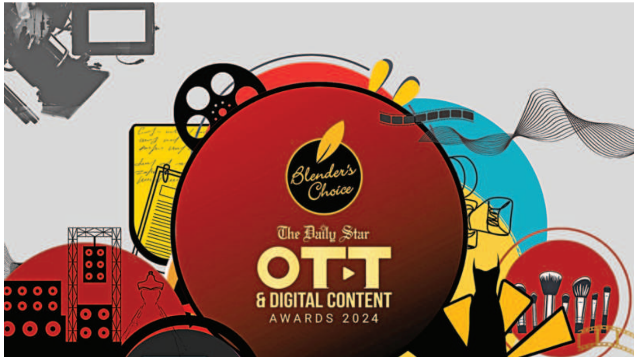
DESIGN: DOWEL BISWAS

While Golam Mamun avoids profligate or eye-catching costumes, Eimon Khandoker's designs perfectly match the series' gritty mood. His carefully considered, character-focused approach lends the narrative a strong sense of realism, quietly heightening its tension and authenticity. He surely deserves the nomination.