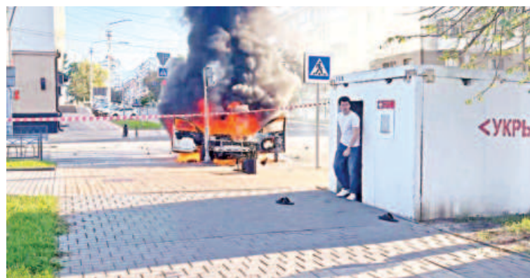
This handout video grab shows a scene from a reported Ukrainian strike in Belgorod, Russia, yesterday.

His comments signalled that Russia will raise the issue of nuclear arms control as part of a wide-ranging discussion on security when he sits down with Trump in Anchorage for the first Russia-US summit since June 2021.