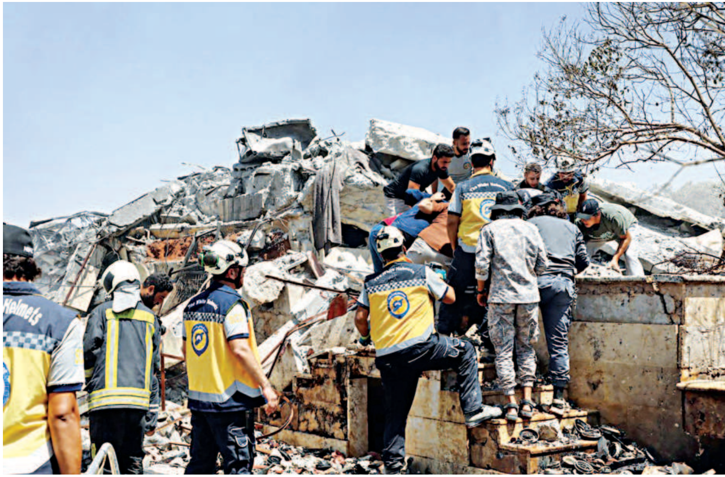
Rescue teams evacuate victims from the rubble following a blast in Idlib, which, according to the Syrian Observatory for Human Rights, struck "a base for non-Syrian fighters containing a weapons depot" in the northwestern Syrian province yesterday. Four people were killed and five were injured in the explosion, state media said.

Chinese Foreign Minister Wang Yi is expected for talks in New Delhi on Monday, according to Indian media.