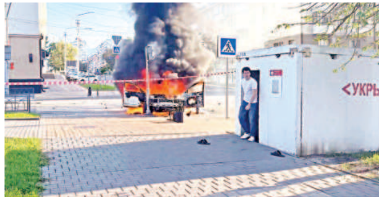
This handout video grab shows a scene from a reported Ukrainian strike in Belgorod, Russia, yesterday.

His comments signalled that Russia will raise the issue of nuclear arms control as part of a wide-ranging discussion on security when he sits down with Trump in Anchorage for the first Russia-US summit since June 2021.