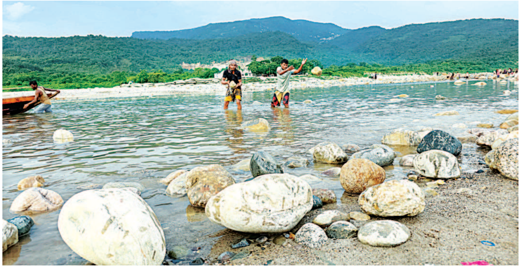
Workers even out recovered stones on the Dhalai river at Sada Pathor in Sylhet's Bholaganj yesterday. Law enforcers and security forces intercepted trucks and boats loaded with stones stolen from Sada Pathor and forced the thieves to bring those back to the river. Boatloads of stones were dumped in the river yesterday. Story on page 3.

The commission will also seek a pledge from the parties to give constitutional and state recognition to the uninterrupted struggle for democracy, human rights, and justice, and to the historical significance of the 2024 anti-discrimination democratic movement and mass uprising.