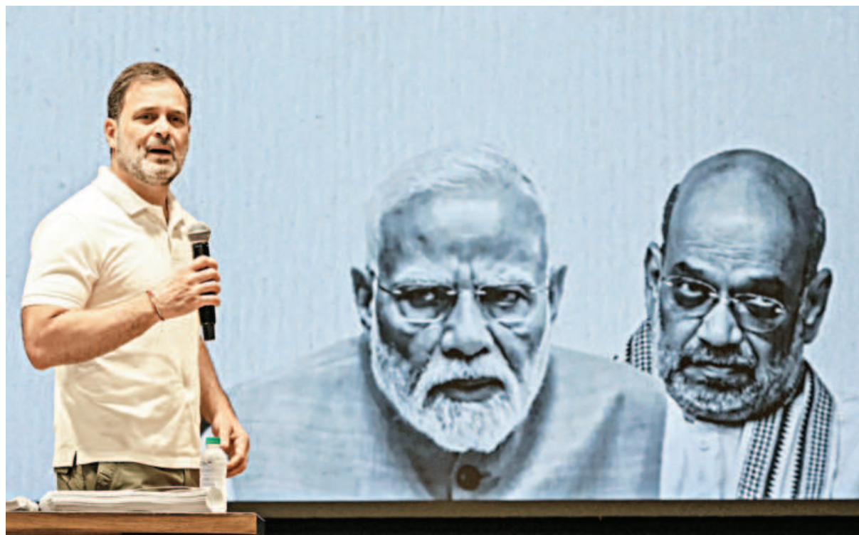
Indian National Congress (INC) party leader Rahul Gandhi addresses the media in front of a screen showing India's Prime Minister Narendra Modi (C) and Home Minister Amit Shah at the party headquarters in New Delhi yesterday, ahead of the upcoming assembly elections in India's Bihar state.

In Europe, Nordic countries saw an unprecedented string of hot days, including more than 20 days above 30C across Finland.