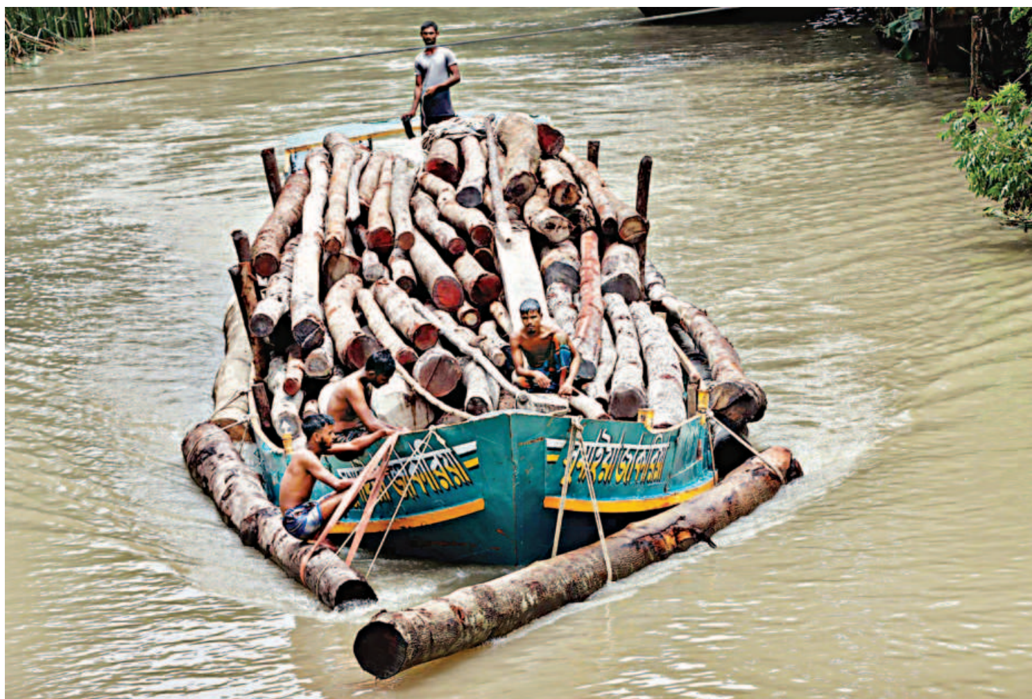
A heavily loaded boat takes logs to the wholesale timber market in Swarupkathi upazila, Pirojpur, from where they are distributed nationwide. The photo was taken yesterday in the upazila's Andakool area.