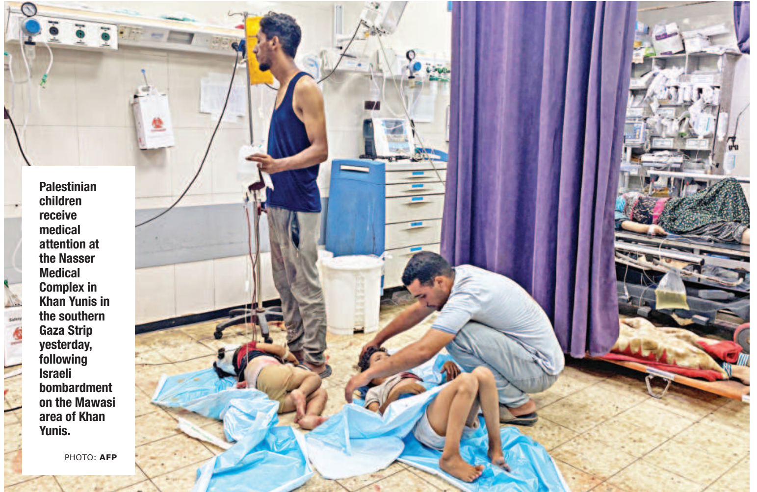
Palestinian children receive medical attention at the Nasser Medical Complex in Khan Yunis in the southern Gaza Strip yesterday, following Israeli bombardment on the Mawasi area of Khan Yunis.