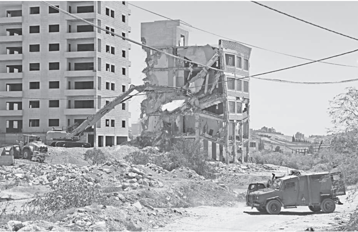
An Israeli excavator demolishes a building in the West Bank village of Judeira yesterday, citing lack of a construction permit in Area C—territory designated by the 1995 Oslo Accords as part of the occupied Palestinian lands under full Israeli control.

Meanwhile, India's National Security Adviser Ajit Doval is in Russia on a scheduled visit and is expected to discuss India's purchases of Russian oil in the wake of Trump's pressure on India to stop buying Russian crude, according to another government source.