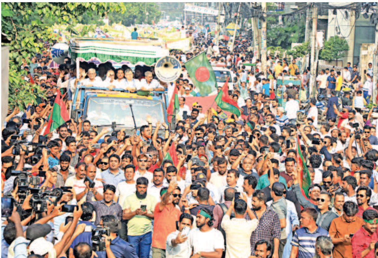
Top BNP leaders arrive at the party's Nayapaltan headquarters on a truck to take part in a victory rally. The BNP and its affiliate bodies held similar rallies across the country yesterday to commemorate the historic achievement of the July uprising last year.