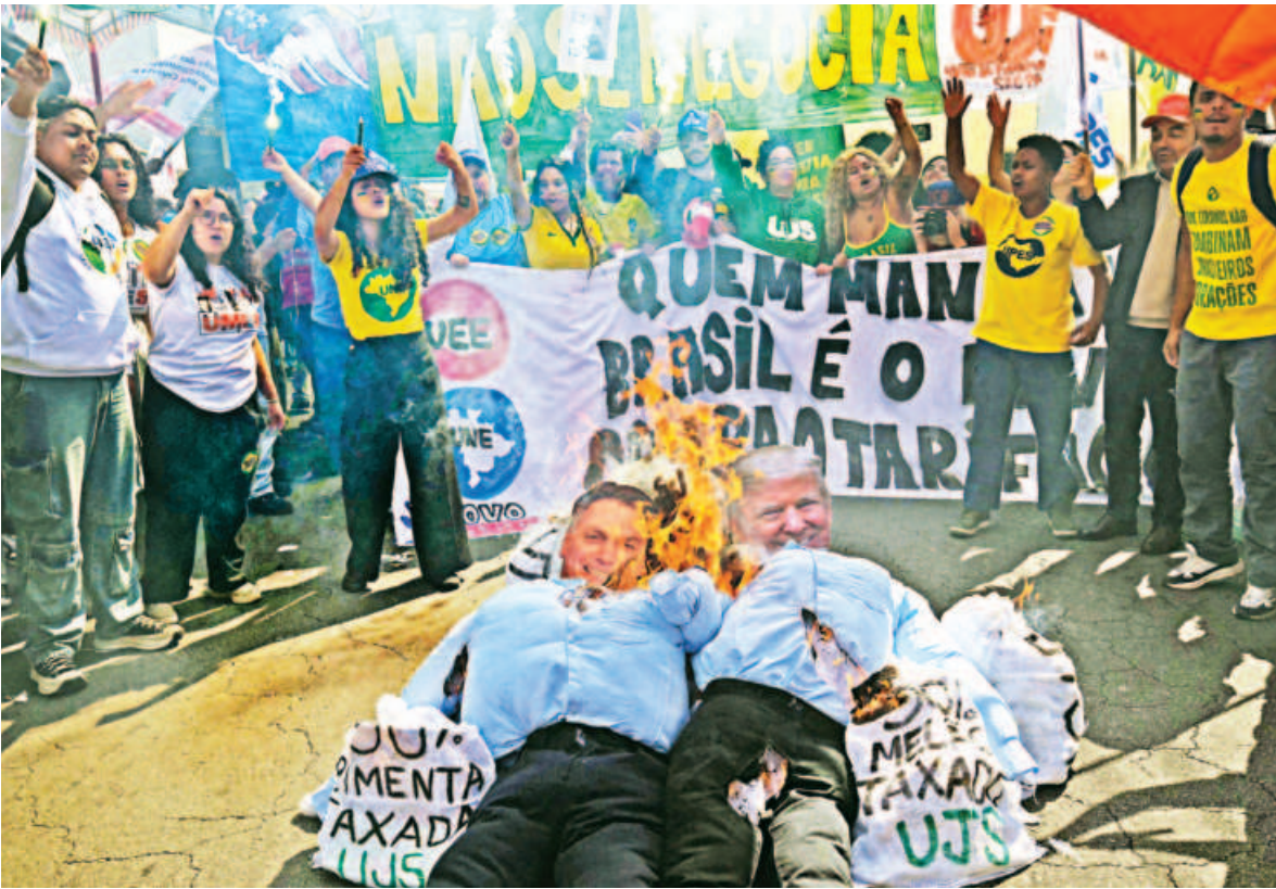
Protesters burn dummies depicting US President Donald Trump and Brazil's former President Jair Bolsonaro during a demonstration condemning US government trade taxes and sanctions on Brazil, near the US consulate, in Sao Paulo, Brazil, on Friday.