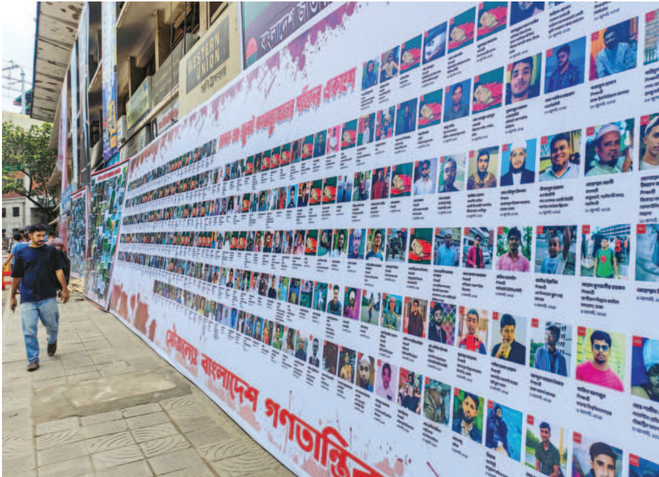
Names, photos, and brief details of many of those killed in last year's July uprising on display at TSC on the Dhaka University campus yesterday. The exhibition was organised by Bangladesh Gonotantrik Chhatra Sangsad.

"It is disheartening to see corruption even in the construction of graves for those who gave their lives for the country. This cannot be allowed to continue."