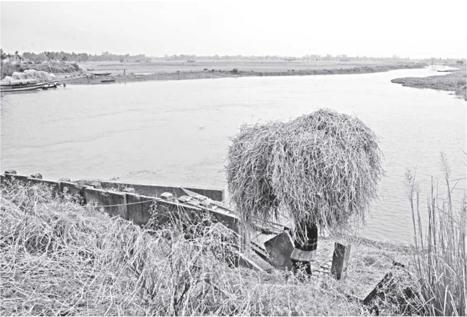
Straw being transported from various villages in the Atrai upazila of Naogaon by a boat to Pabna. During floods, Pabna faces a severe shortage of straw, which is vital for feeding cattle. The photo was taken recently.