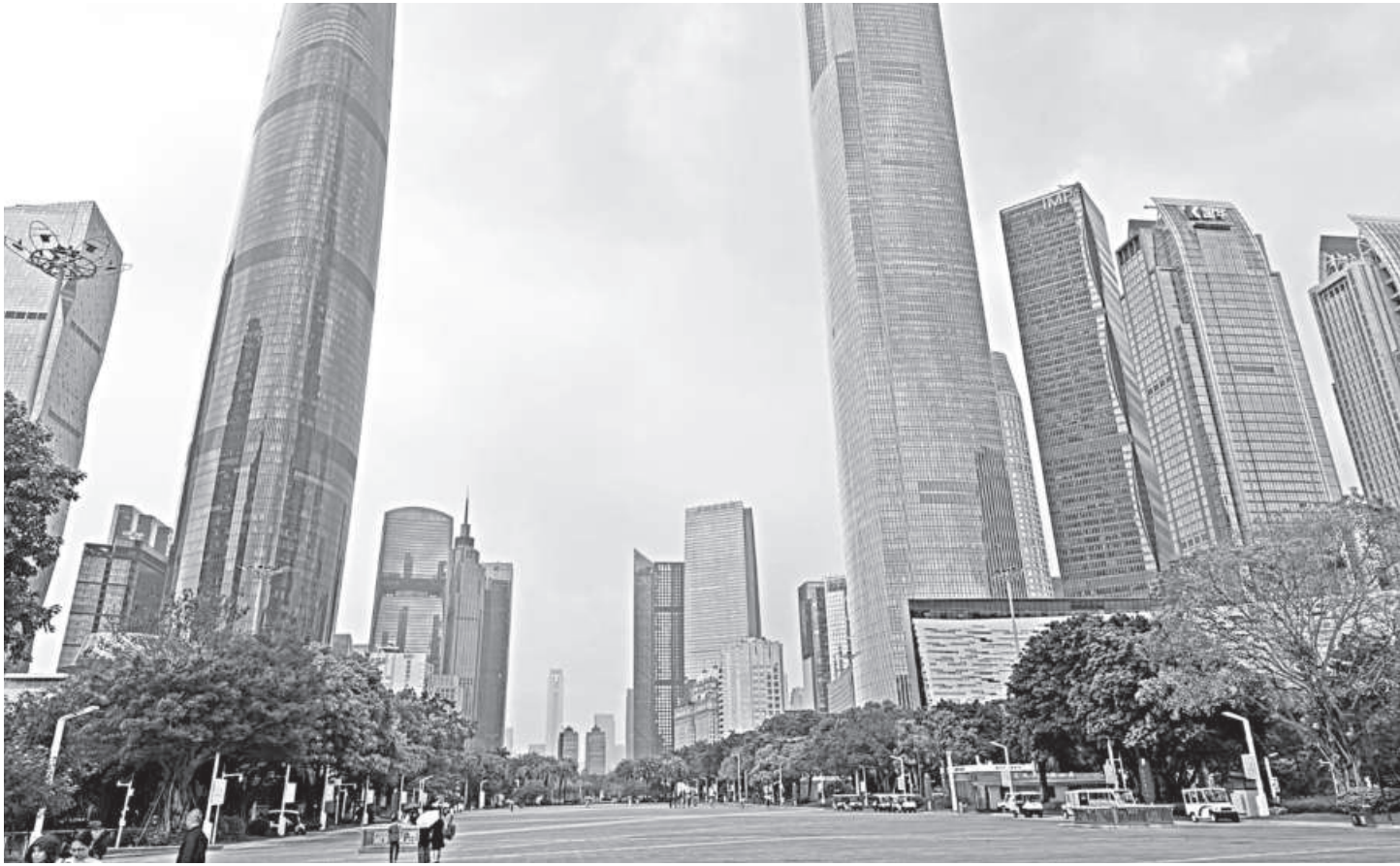
China's progress is deeply rooted in its careful investment in education, especially in science, technology, engineering, and mathematics (STEM).

Technology and artificial intelligence (AI) have been central to China's transformation. In cities like Guangzhou, Shanghai and Beijing, I