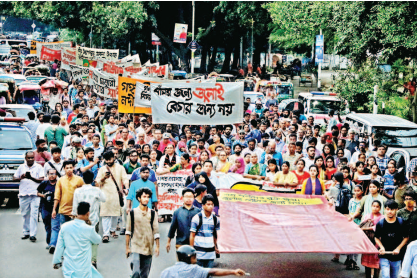
A procession titled "Droho Jatra 2025" in Dhaka University yesterday. The march, from the Central Shaheed Minar to Shahbagh intersection, was organised to demand the dismantling of the fascist state structure, ensuring justice for the mass killings of 2024 and trials for all killings committed in the hills and plains, and resistance against emerging neo-fascist tendencies.