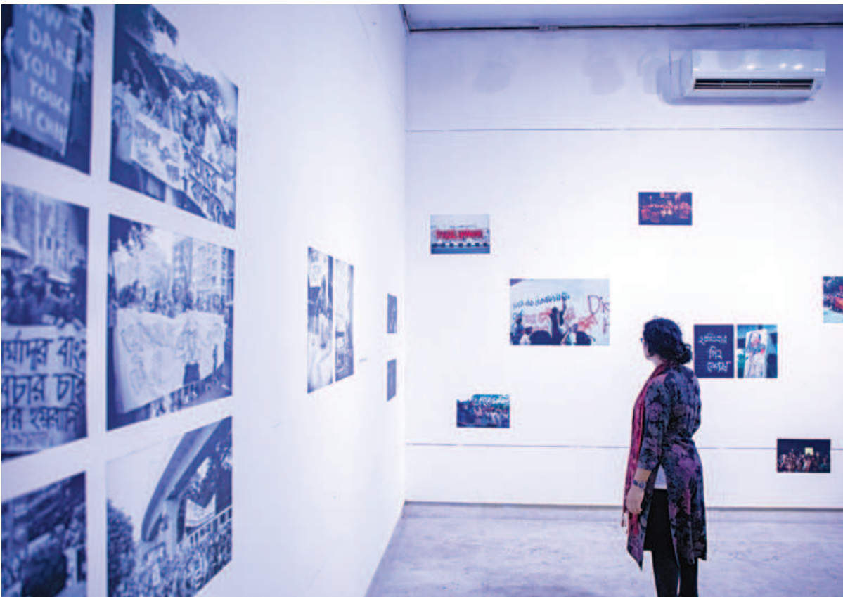
A woman looks at the photographs and posters on display at the day-long event titled "Koilza Kapano 36 Din" at the Bangladesh National Museum yesterday. The event paid respect to the July uprising.