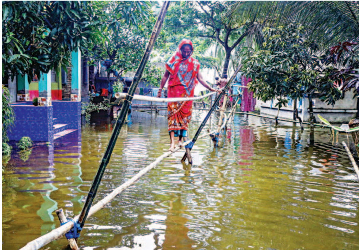
A woman using a bamboo bridge in her yard at home in Sarabhita village of Khulna's Dumuria. Several thousand people in around 100 villages have been waterlogged for over two weeks as the Sholmari and Mayur rivers cannot drain the rainwater. The photo was taken yesterday morning.