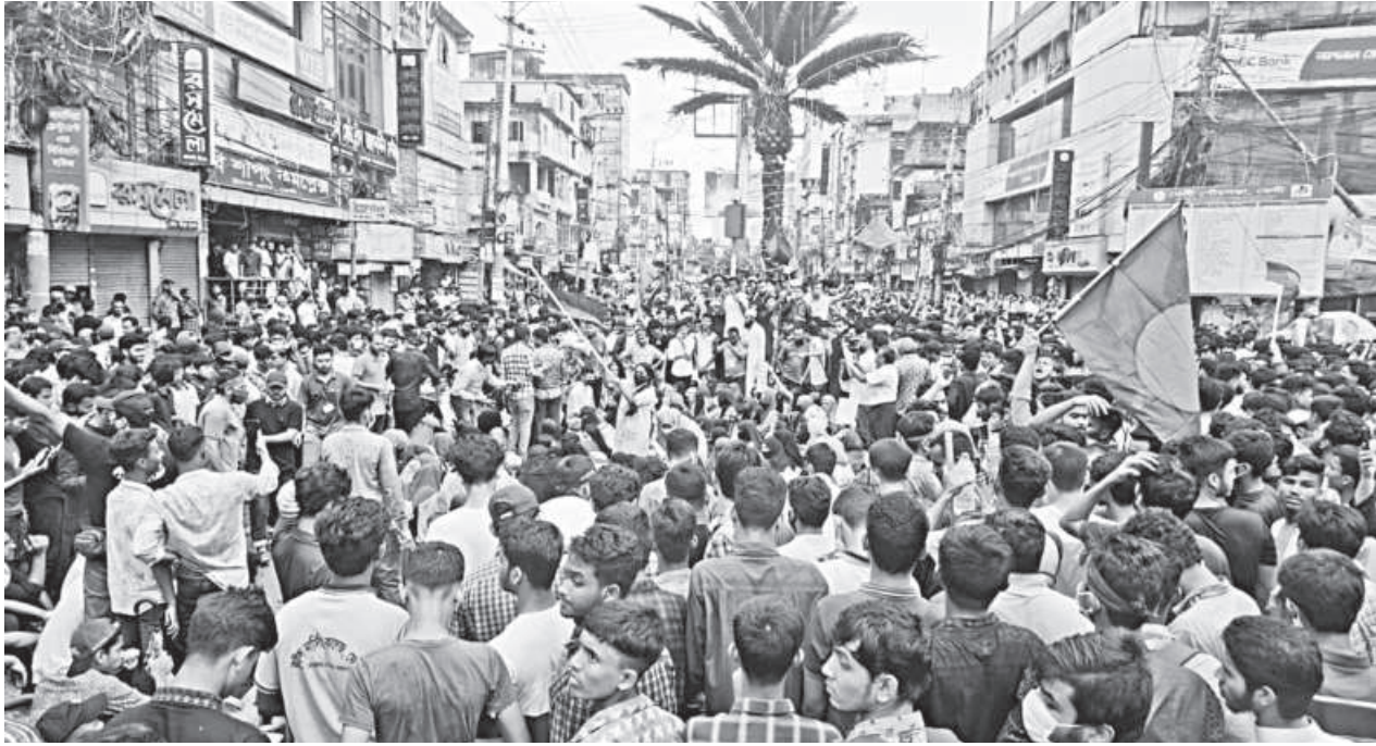
About a year on from the July uprising, young people still feel disillusioned, but they have not given up.

Why are so many young people unable to access opportunities? One word dominates their responses: nepotism. Over 54 percent of the youth cite nepotism as the primary barrier to