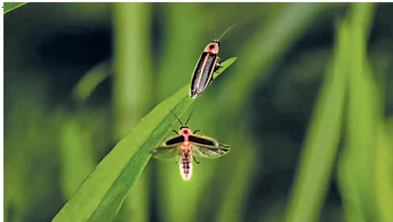
A firefly glows near a wetland in rural Bangladesh. Once common in villages and forests, their numbers have declined drastically.

Fireflies are among nature's most magical insects, but their survival depends on specific environmental conditions: clean water, moist soil, and dark, undisturbed nights. Today, these conditions are vanishing due to four major causes: