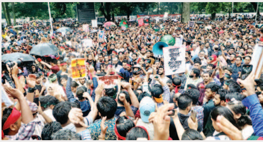
Protesters gather in large numbers at the Central Shaheed Minar in the capital on the afternoon of August 2, 2024, demanding justice for those killed during the quota reform protests.

At the rally, Prof Anu Muhammad stated, “We don’t want anything from this government. The government must resign. The people must take back control of the country and ensure