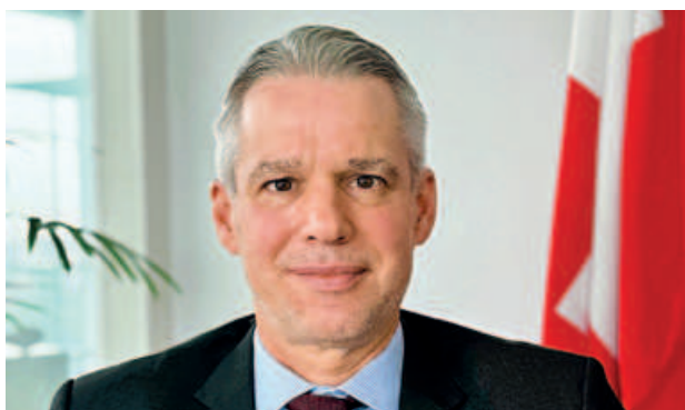
RETO RENGGLI Ambassador of Switzerland to Bangladesh

Switzerland is also a dynamic, multicultural and multilingual nation. Direct democracy and federalism, with a strong local government system, are essential hallmarks of my country, which allows citizens to have the final say in most matters, from the local to the national level.