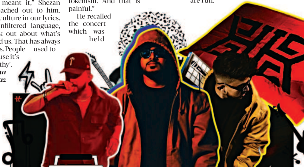
ILLUSTRATION: DOWEL BISWAS