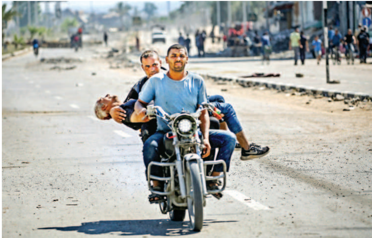
A Palestinian man, reportedly shot while seeking food aid at a distribution point run by the Israeli- and US-backed Gaza Humanitarian Foundation, is carried on a motorcycle in the Bureij refugee camp in central Gaza yesterday.