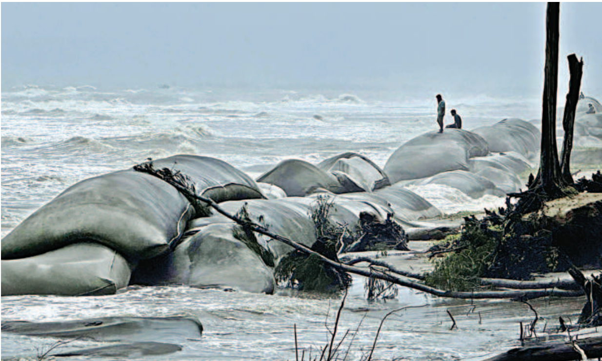
Due to a depression over the Bay, high tidal waves have caused erosion at several points along the Cox's Bazar beach. Over 1,000 jhau (tamarisk) trees along the beach have been uprooted. Efforts to prevent erosion placing geo-tubes have not worked in many areas in recent years. The photo was taken from Shaibal Point yesterday.