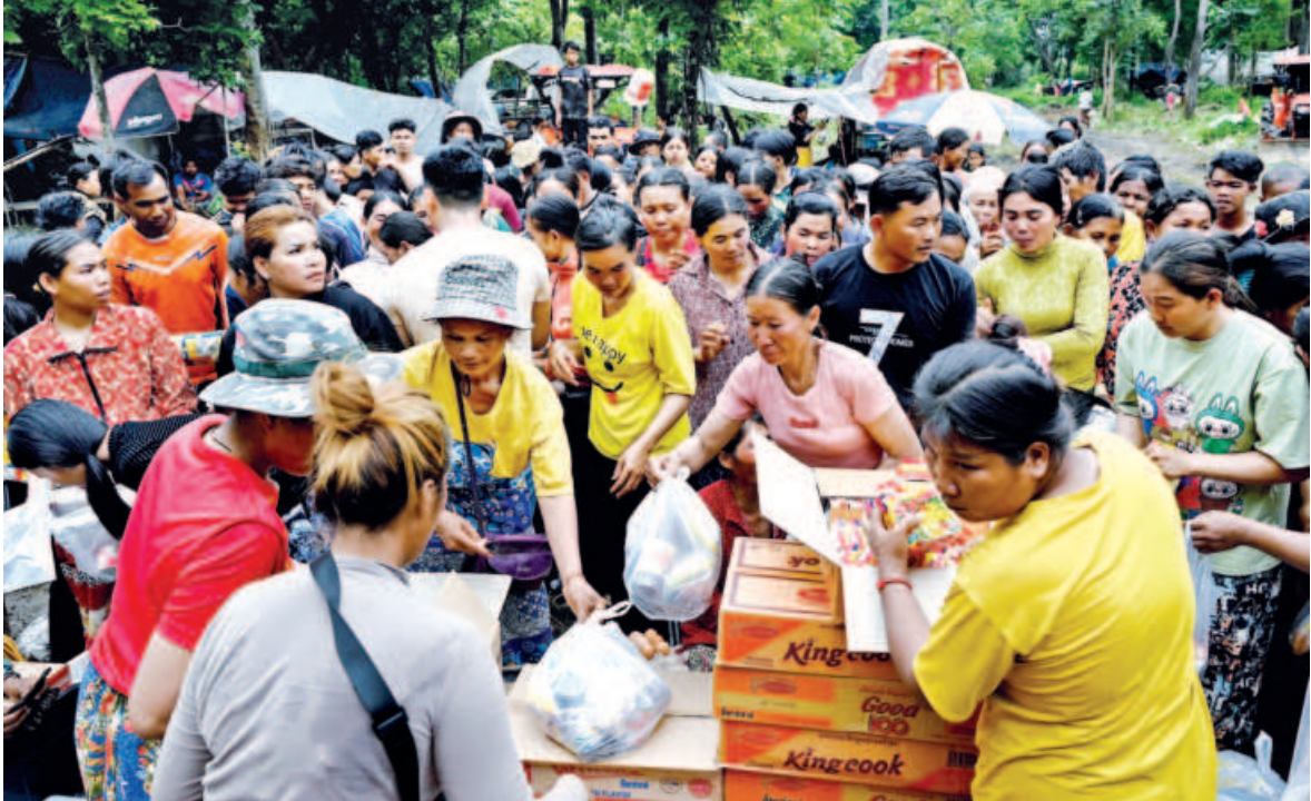
People who fled their homes near the Cambodia–Thailand border gather to receive food on the grounds of a pagoda in Cambodia's Oddar Meanchey province yesterday. Thailand and Cambodia clashed for a fourth consecutive day before agreeing to Malaysia's role as mediator in the border conflict.

AFP, Washington Passengers on a US domestic flight were forced to evacuate onto a runway due to a brake fire just ahead of the plane taking off in Denver, the airline said. American Airlines Flight 3023 was departing for Miami on Saturday but "experienced a mechanical issue" while accelerating ahead of takeoff at Denver International Airport, the airline told AFP, adding all 173 passengers and six crew "deplaned safely". One passenger sustained a minor injury and was taken to a hospital for evaluation, American Airlines said. Blown tires and the deceleration of the plane while braking resulted in an isolated brake fire, which was extinguished by city firefighters, according to the airline. Social media videos published by US media outlets showed passengers frantically evacuating an American Airlines plane via an emergency slide as smoke billowed from beneath the aircraft.