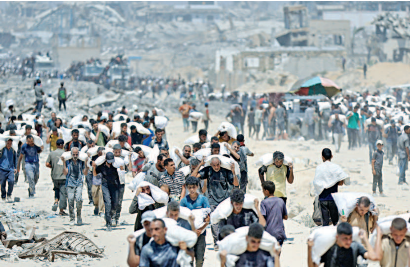
Palestinians carry aid supplies that entered Gaza through Israel, in Beit Lahia, northern Gaza Strip, yesterday. Two Jordanian and one Emirati plane dropped 25 tonnes of humanitarian aid over the Gaza Strip, the Jordanian army said in a statement.

means to resolve conflict in Ukraine, but Kyiv and the West rejected that path, Russian news agencies reported yesterday, citing Kremlin spokesman Dmitry Peskov. "Our preferred route is through political and diplomatic means," Peskov said, according to TASS state news agency. Peskov added, without providing evidence, that Moscow continues its military operation in Ukraine because "all proposals for dialogue were rejected, both by Ukraine and by Western countries." Meanwhile, Russia said yesterday a major annual navy parade had been cancelled for "security reasons", without specifying the threat or concern. "It has to do with the general situation. Security reasons are of utmost importance," said Kremlin spokesman Dmitry Peskov, quoted by Russian news agencies. The parade was meant to be the highlight of Russia's Navy Day, which falls on the last Sunday of July each year and honours the country's sailors. But local authorities in the coastal city of Saint Petersburg, where the warships and submarines were scheduled to pass, said on Friday the parade had been cancelled without giving a reason.