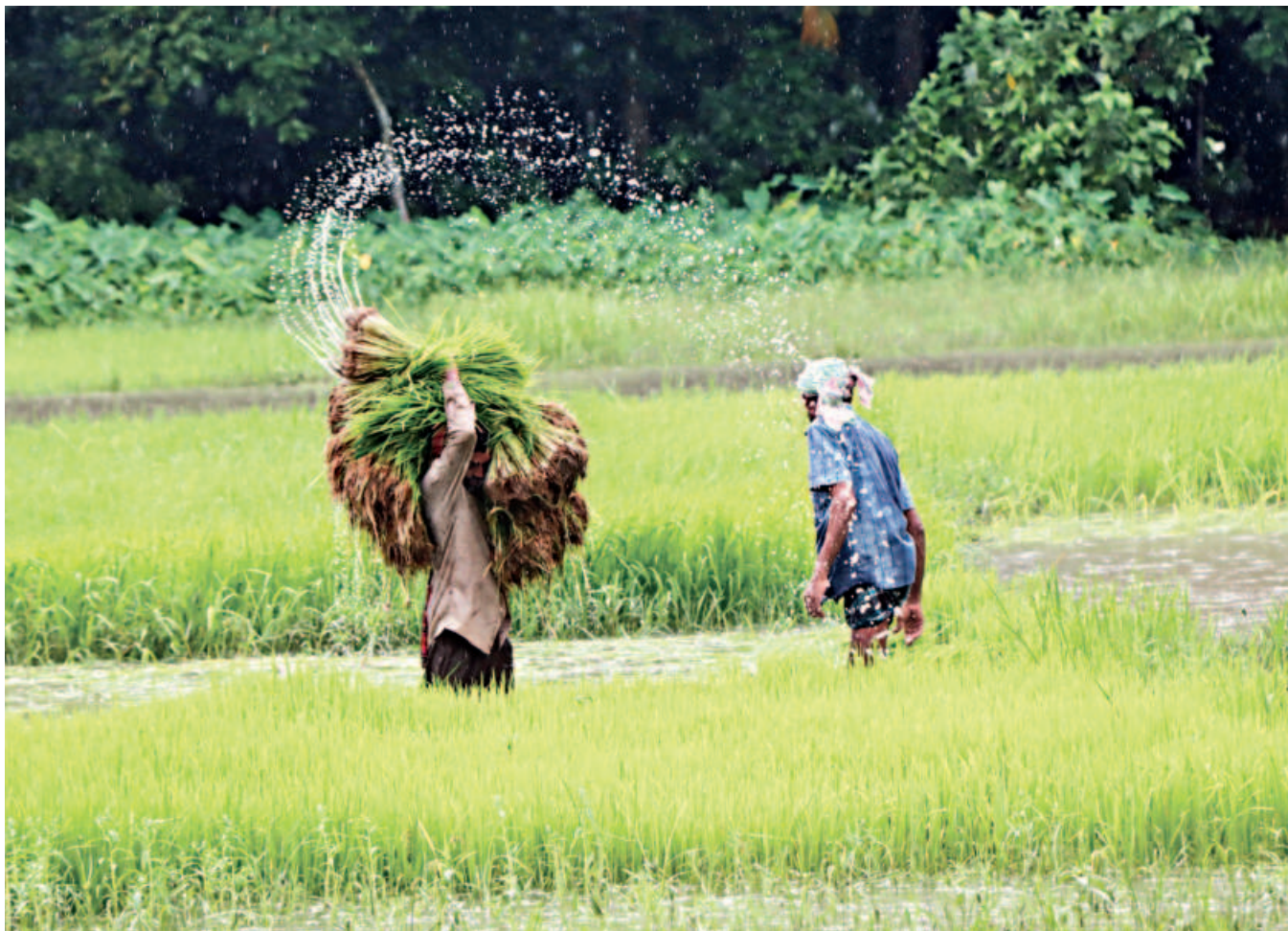
CARRYING THE SEASON FORWARD. In the vibrant greenery of Rakudia village in Barishal, farmers take bundles of Aman paddy seedlings from seedbeds to nearby fields for transplantation -- a seasonal ritual of Shrabon and Bhadra. The crop will be harvested during Agrahayan and Poush. The photo was taken yesterday.